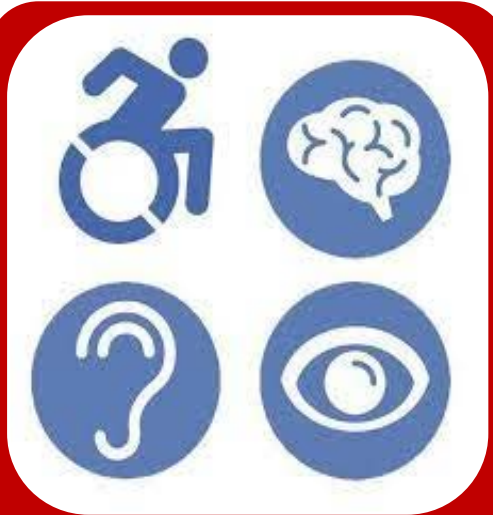
[Goal Area 3] Accessibility of City Programs