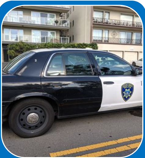
[Goal Area 1] Policing and Safety