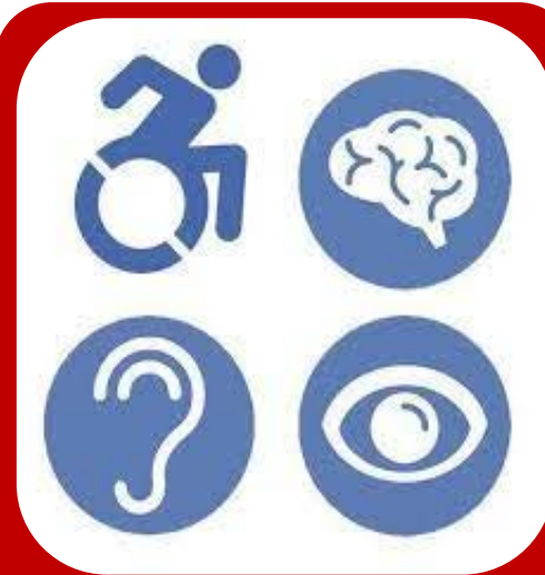
[Goal Area 3] Accessibility of City Programs