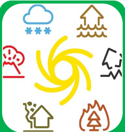
[Goal Area 2] Environmental Impacts & Concerns