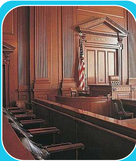
[Goal Area 5] Civil Liberties