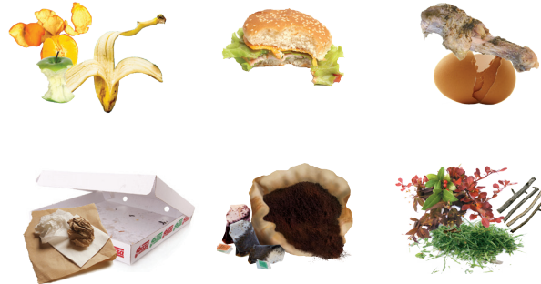
Food Scraps, Non-coated/lined Food-Soiled Paper, Plant Debris, Untreated Wood