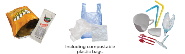
Including compostable plastic bags.