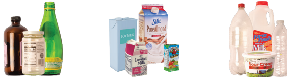
Recycle #1 (bottles), #2 (jugs), and #5 (tubs)