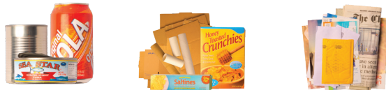
Empty Glass, Aluminum, Metal & Plastic Containers, Beverage & Soup Boxes, Clean Paper & Cardboard