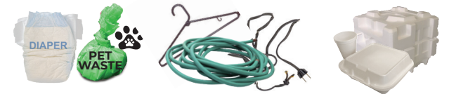
Non-Recyclable, Non-Compostable, Non-Hazardous Materials