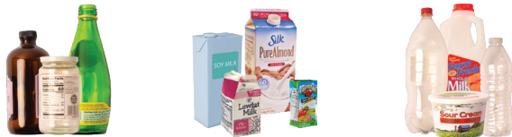
Recycle #1 (bottles), #2 (jugs), and #5 (tubs)