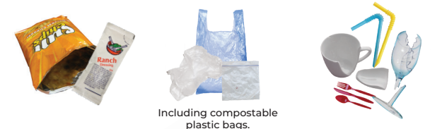
Including compostable plastic bags.