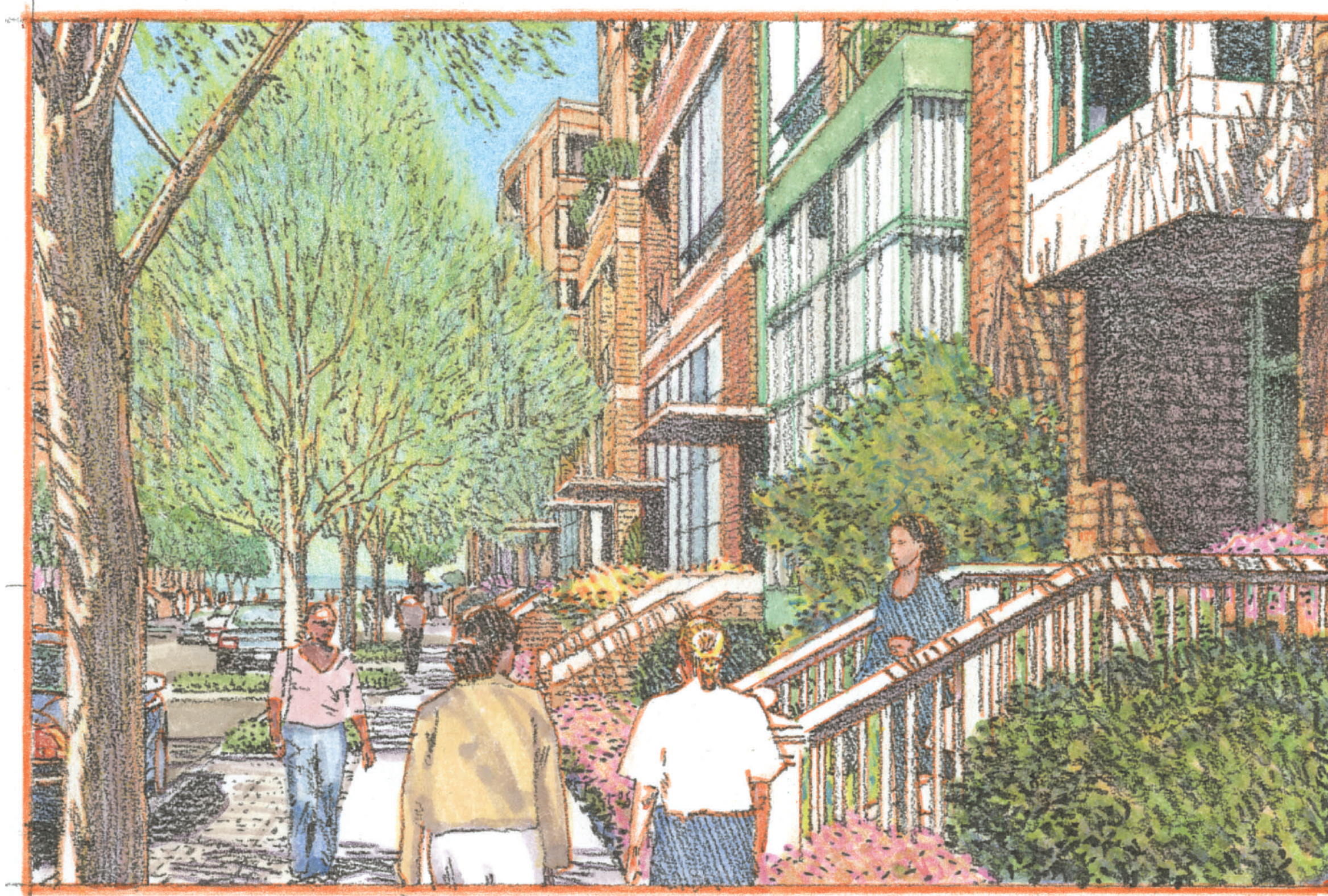
Eighth Avenue Typical Residential Streetscape