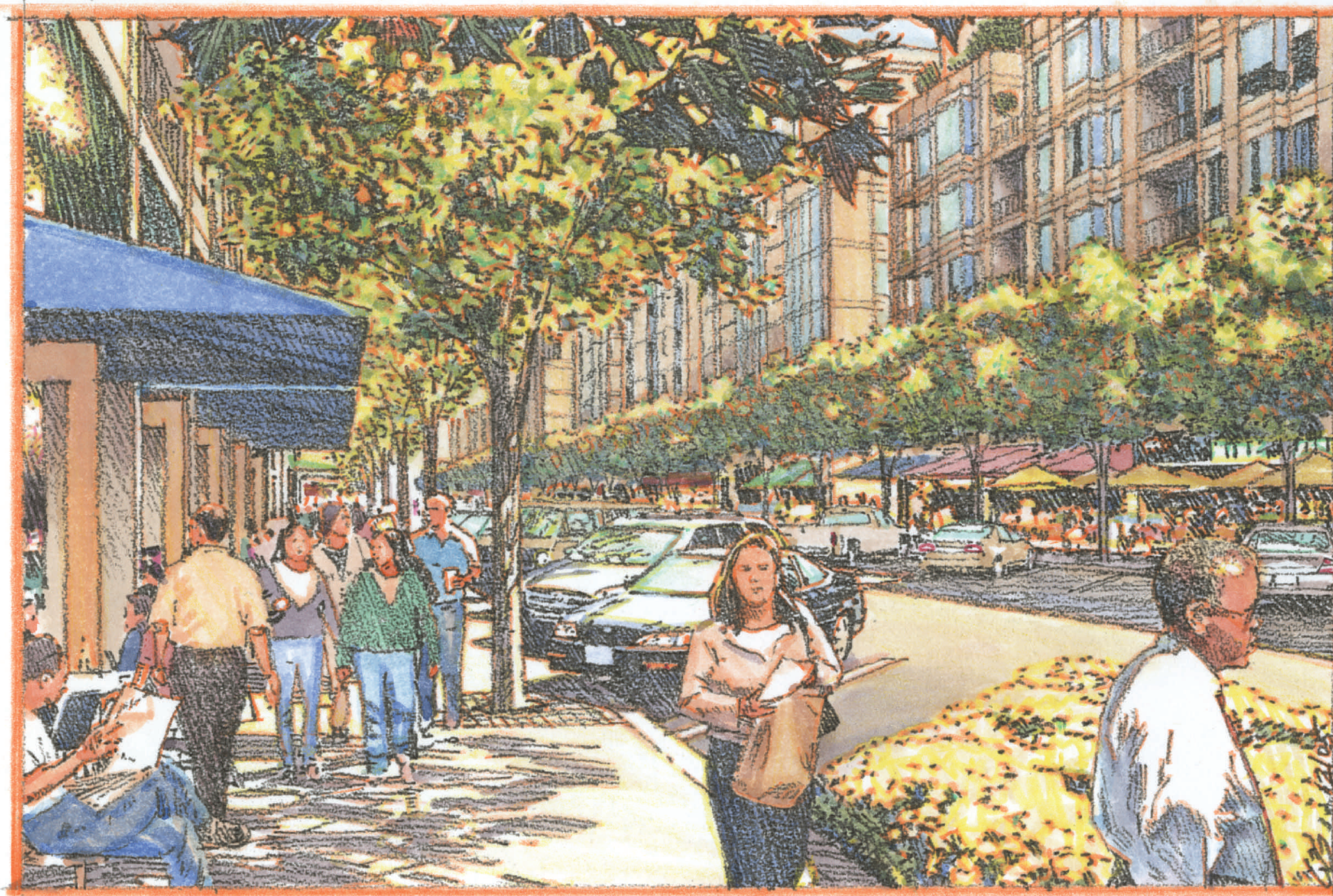
Main Street Commercial Streetscape