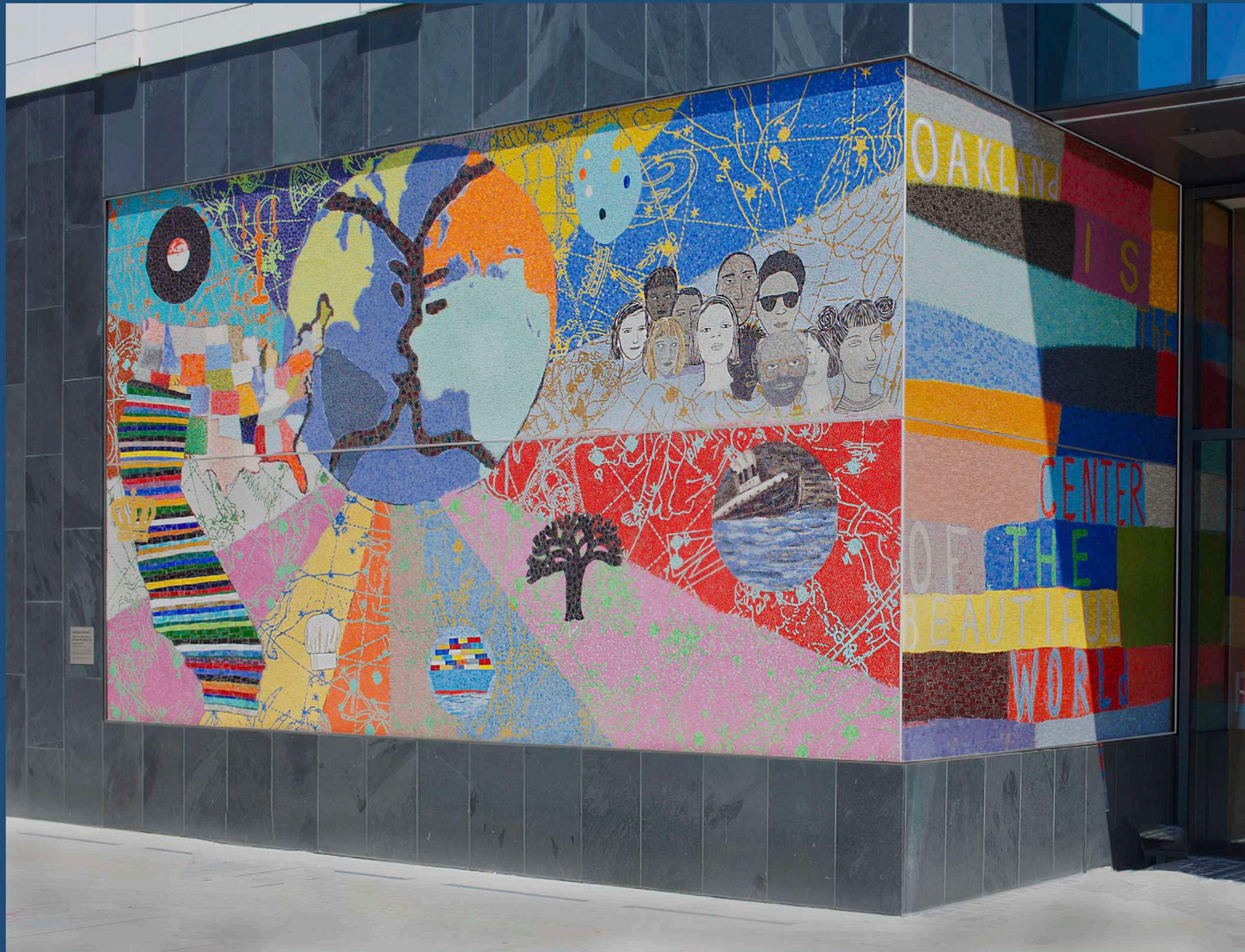
Oakland is the Center of the World, 2021 Artist: Squeak Carnwath;