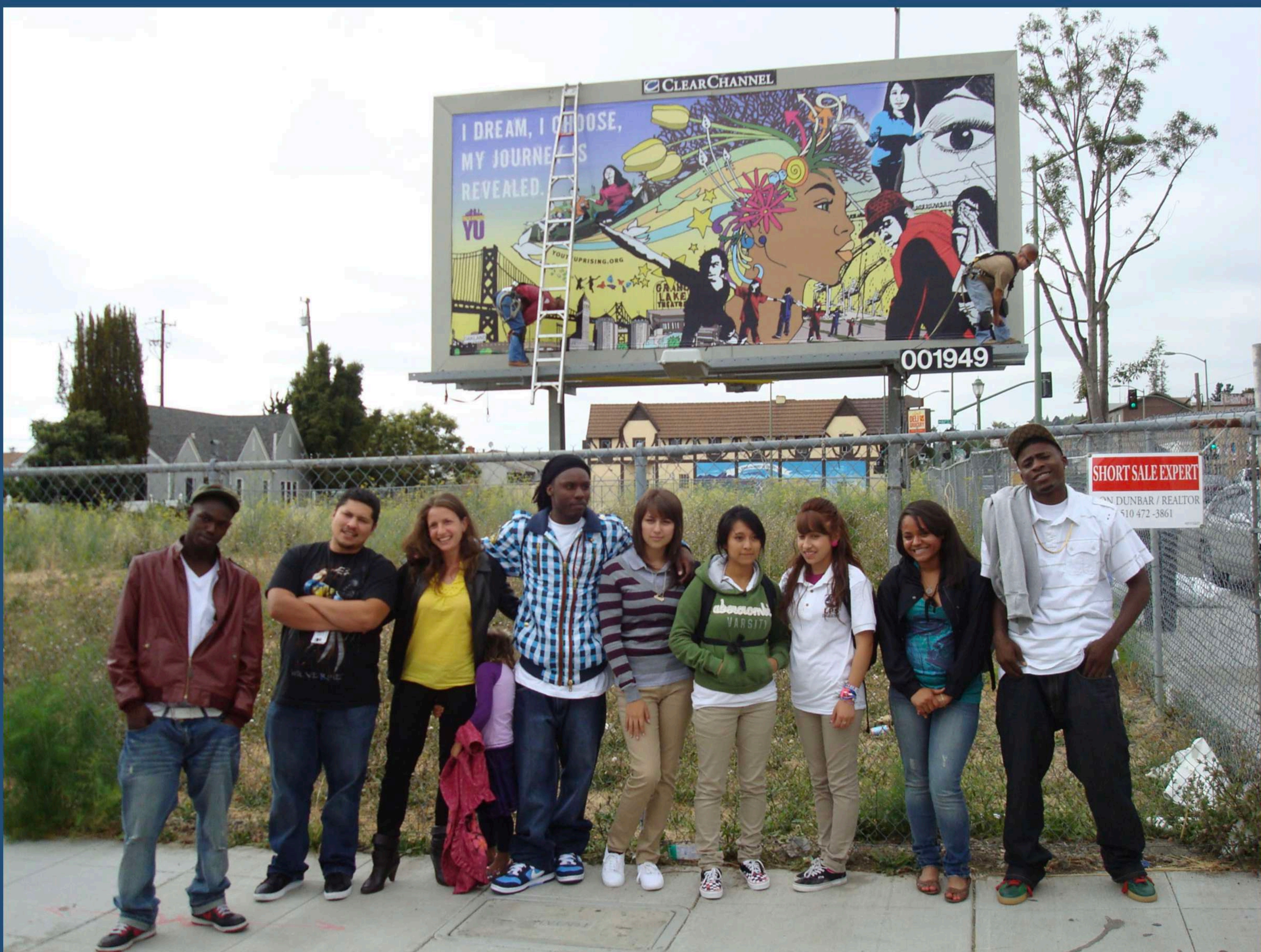
Youth UpRising Billboard Murals Project