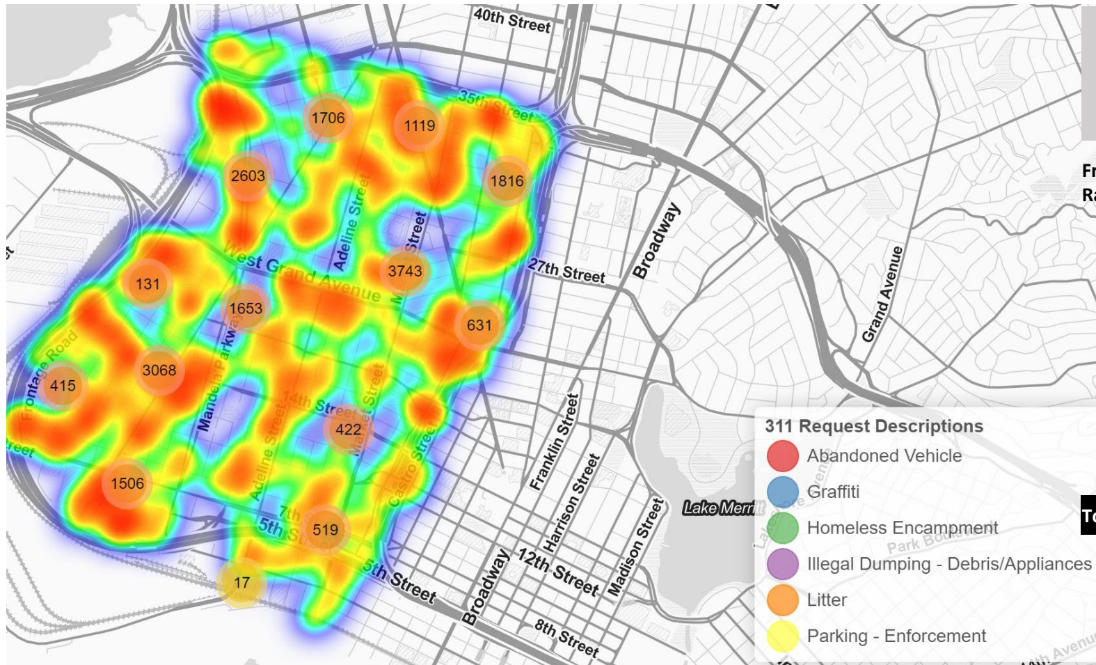
West Oakland Top 6 311 Incidents by Request Description since January 2020