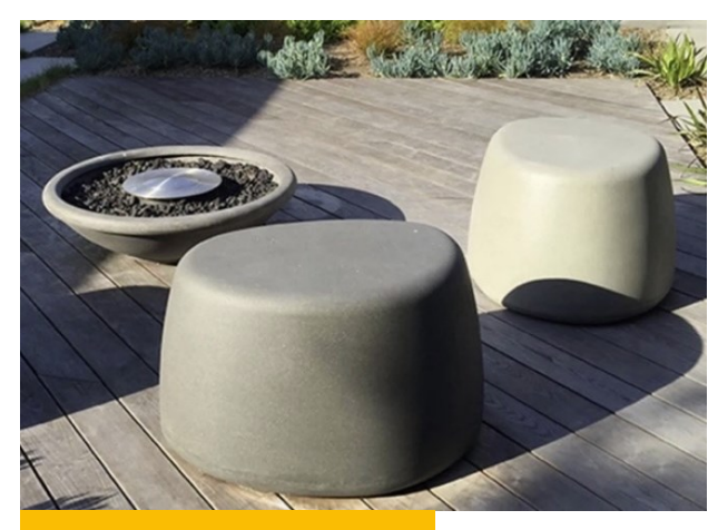
Classic – 28%