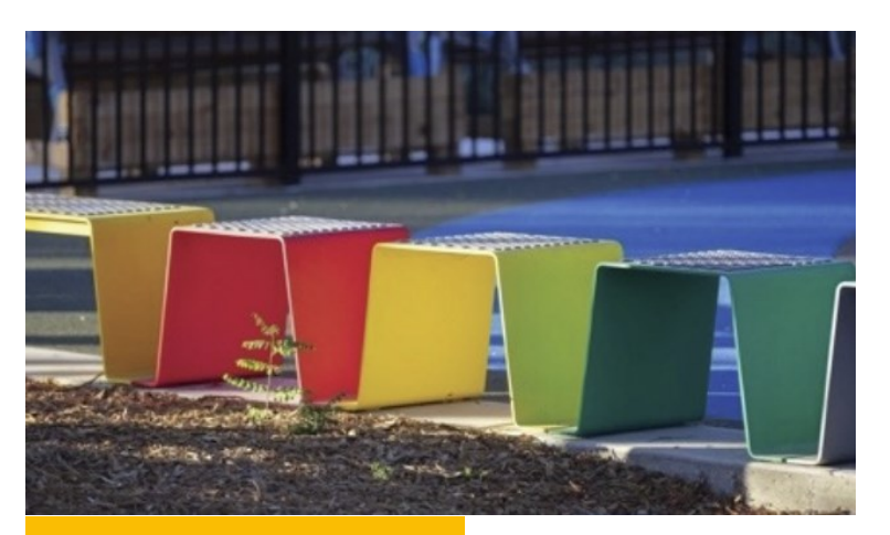
Colorful - 29%