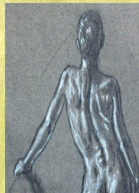
Drawing by Bill Roth

Gain greater confidence in your ability to compose and render the human form. This class provides an in-depth study of how to draw the human figure using live models. You will focus on basic proportions and proper construction of the human form as well as light and shadow, contour, line, and composition. In-class drawing exercises will be enhanced by demonstrations of how to simplify and assemble the more complex areas of the body. * Class fee includes $75 model fee