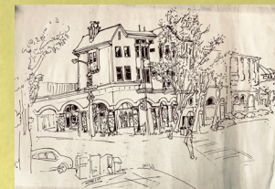
Drawing by Mokhtar Paki

Learn how to use pen/ink and gain confidence in creating bold contrast and strong image without fear. We will focus on the fundamentals of line style, shading, perspective and face & Figure drawing.