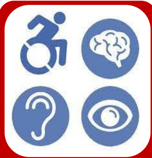
[Goal Area 3] Accessibility of City Programs