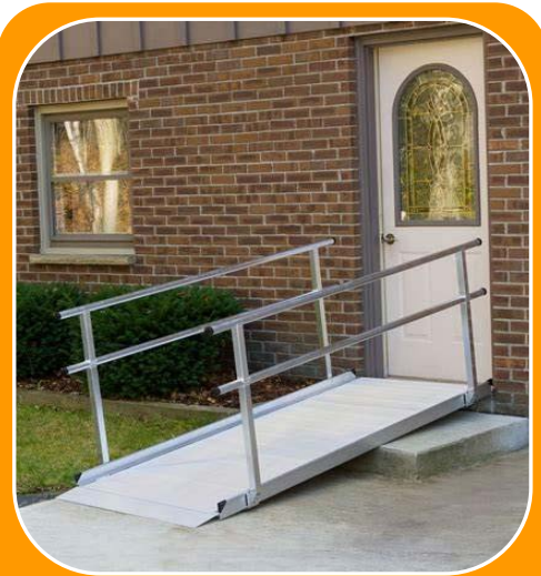
[Goal Area 4] ADA Accessible Housing