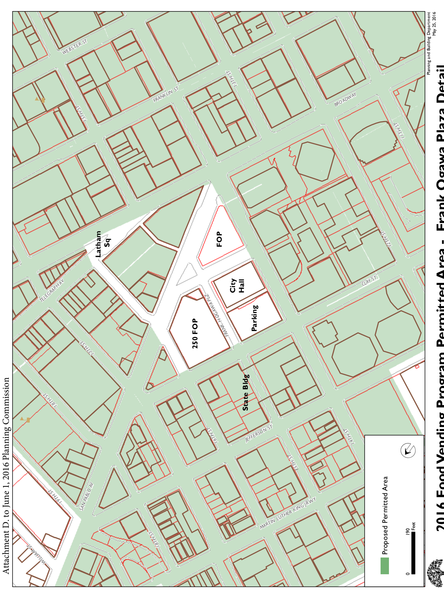
Frank Ogawa Plaza Detail 2016 Food Vending Program Permitted Area -