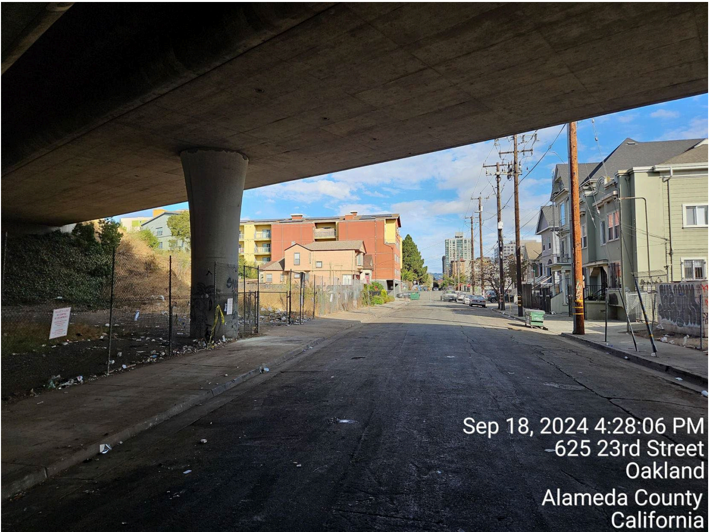
Sep 18, 2024 4:28:06 PM -625 23rd Street Oakland Alameda County California