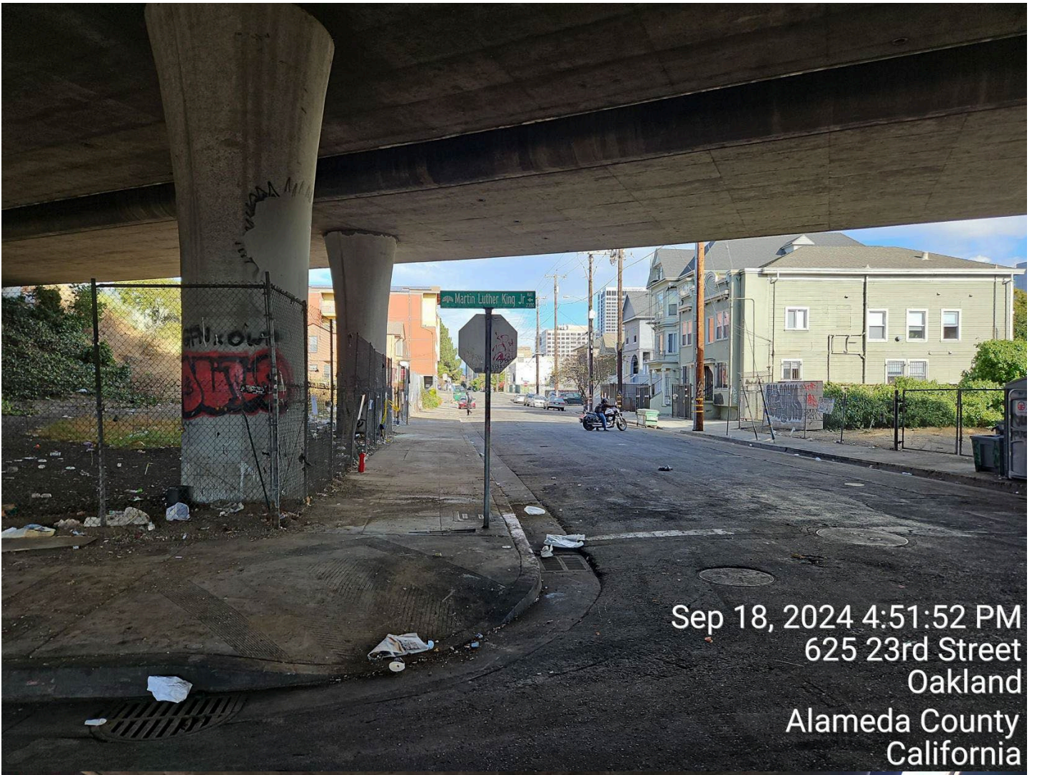
Sep 18, 2024 4:51:52 PM 625 23rd Street Oakland Alameda County California