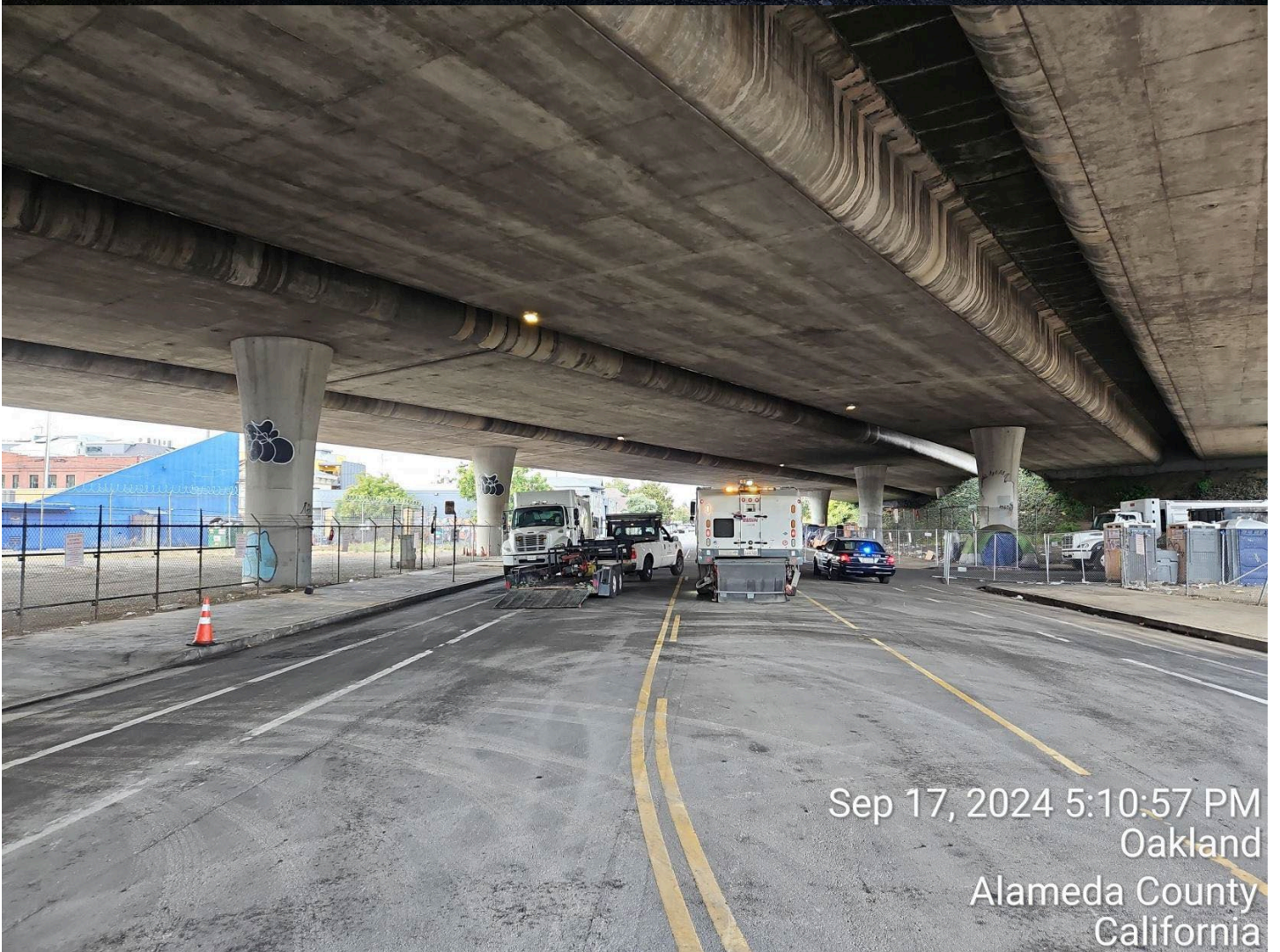
Sep 17, 2024 5:10:57 PM Oakland Alameda County California