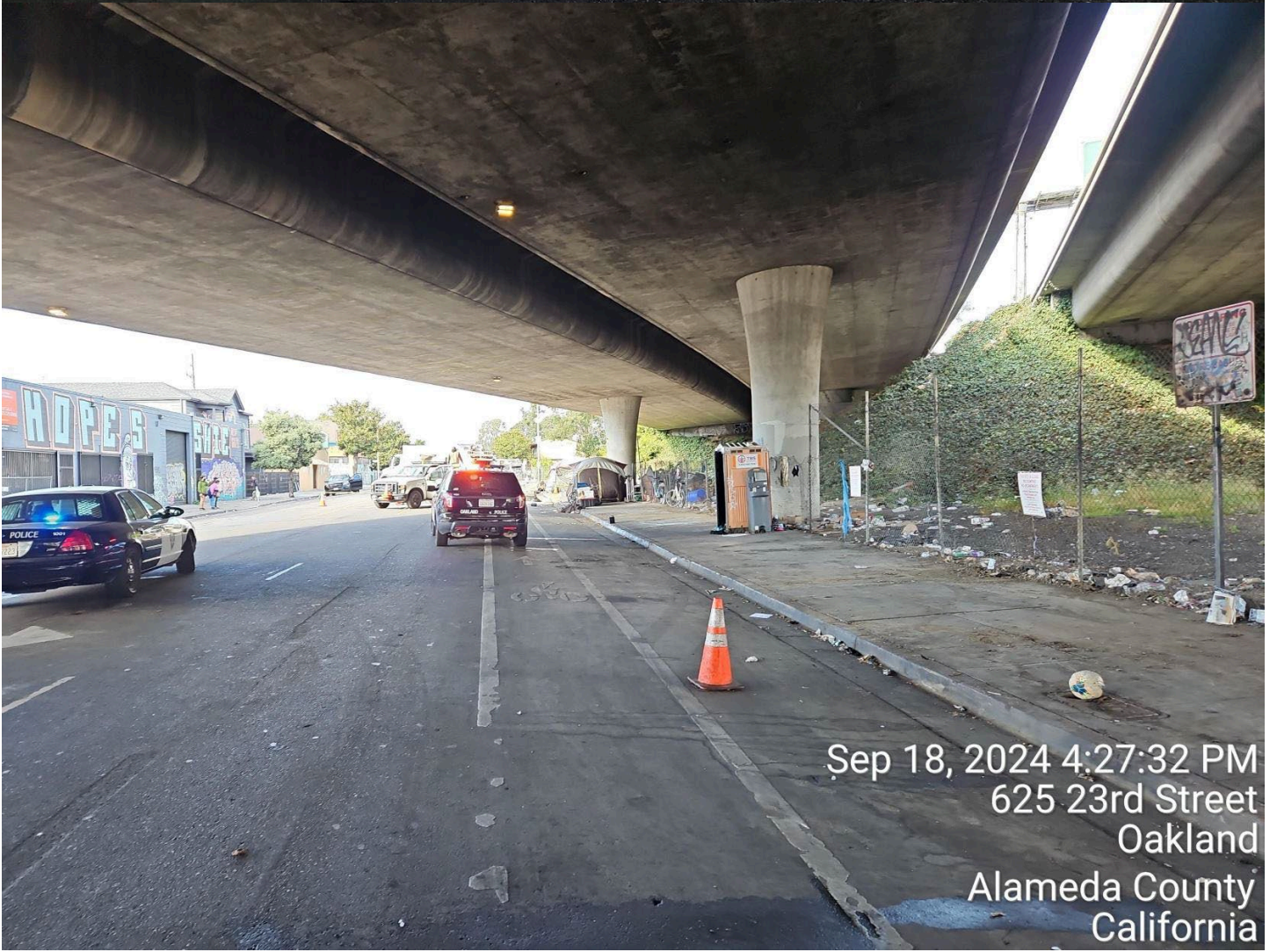
Sep 18, 2024 4:27:32 PM 625 23rd Street Oakland Alameda County California