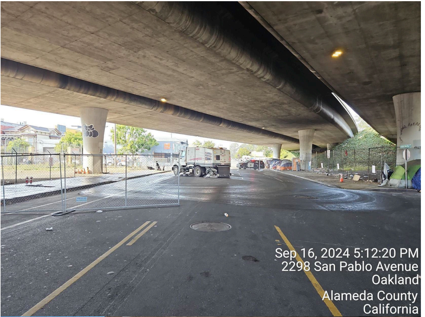
Sep 16, 2024 5:12:20 PM 2298 San Pablo Avenue Oakland Alameda County California