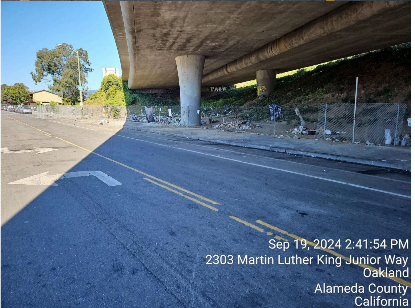
Sep 19, 2024 2:41:54 PM 2303 Martin Luther King Junior Way Oakland Alameda County California