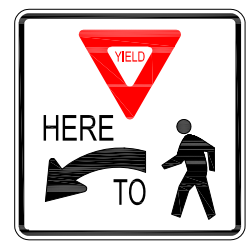
MUTCD R1-5 SIGN