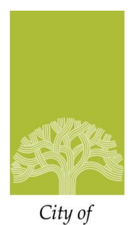
City of OAKLAND California