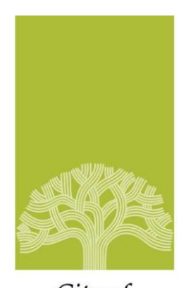
City of OAKLAND California