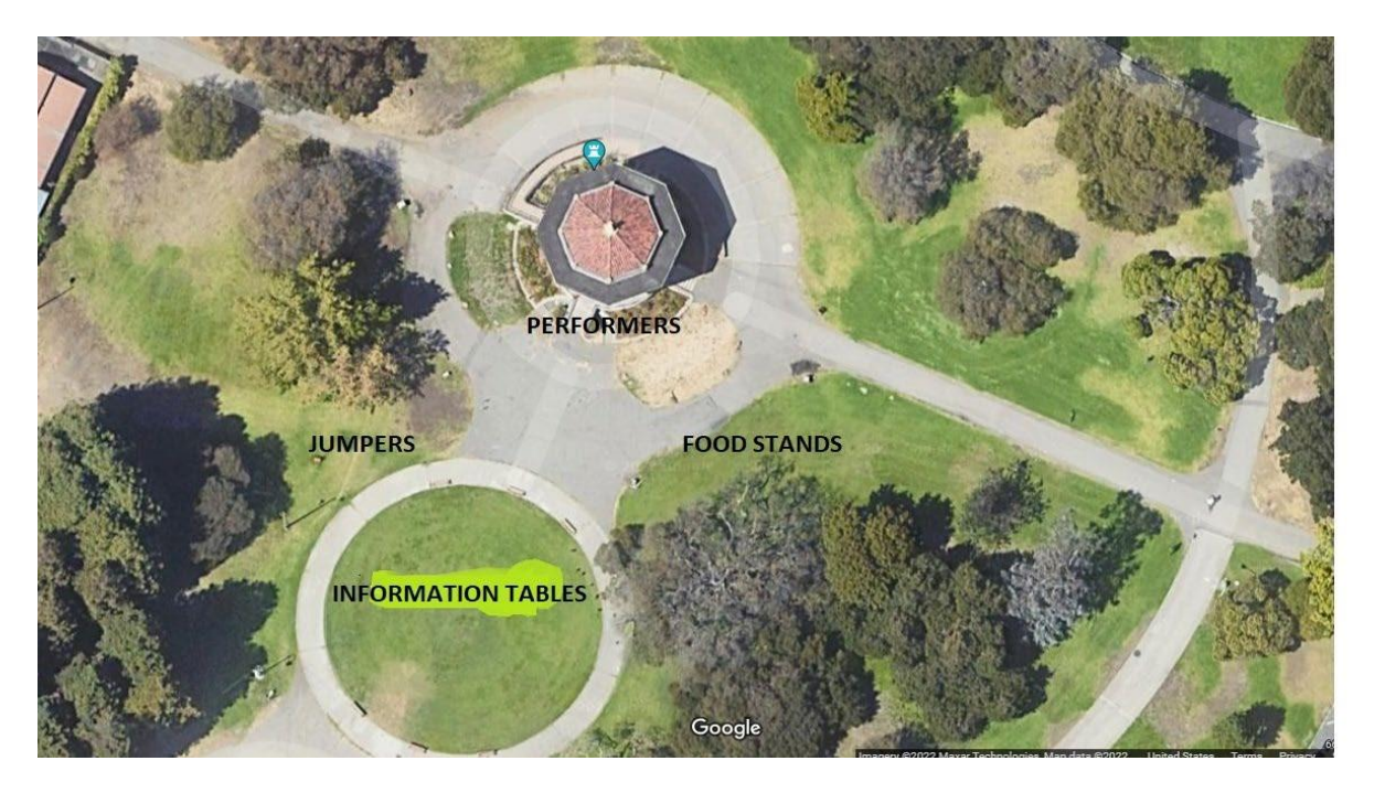
Exhibit B – Layout Item 6B