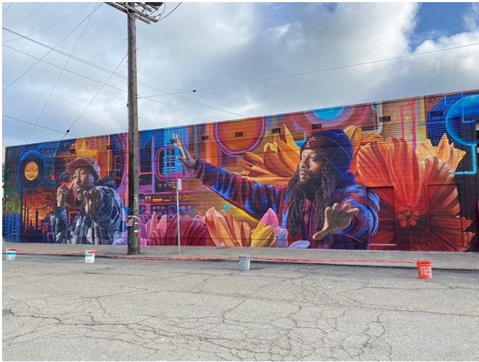
Love Letter to Oakland #3: Souls of Mischief Tribute High St & Wattling Oakland