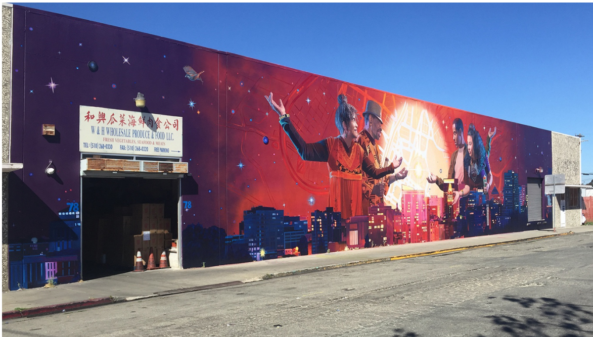
Love Letter to Oakland #1 Oak & 4 th St Oakland