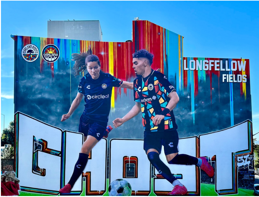
Oakland Roots/Soul Mural MLK & 39 th St Oakland