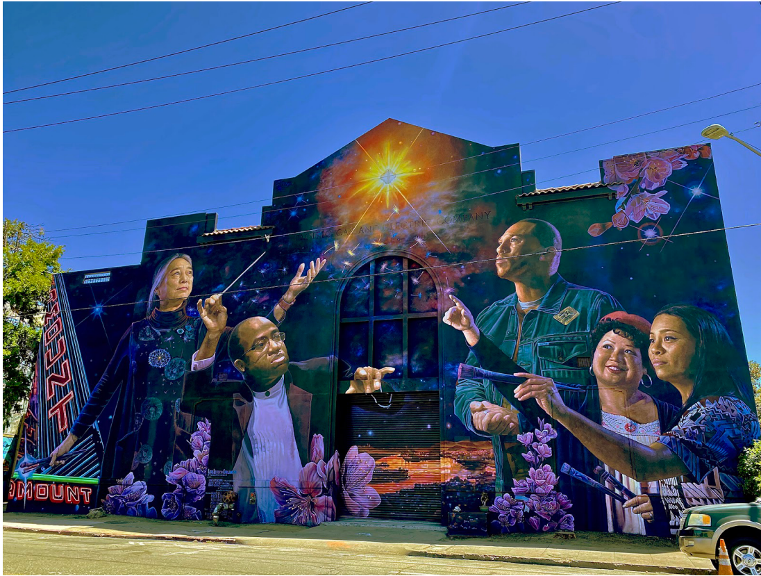
Love Letter to Oakland #2 Shattuck & 51st Oakland