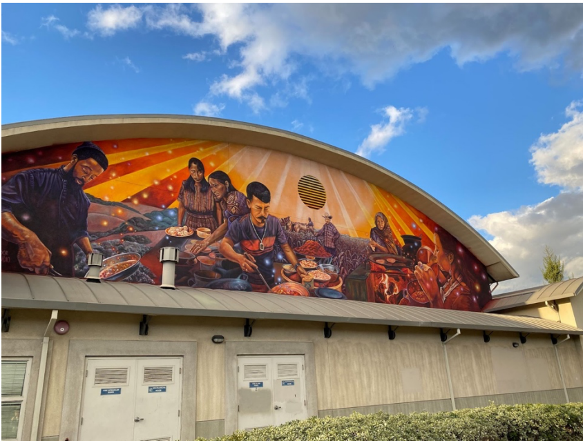
Hayward Stack Mural Hayward CA