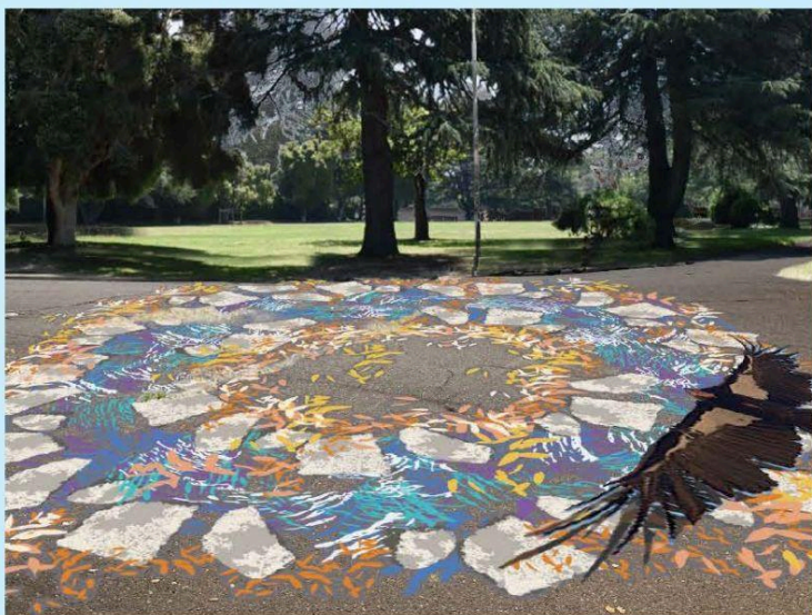
Mock-up of what the mural will look like at Arroyo Viejo Park