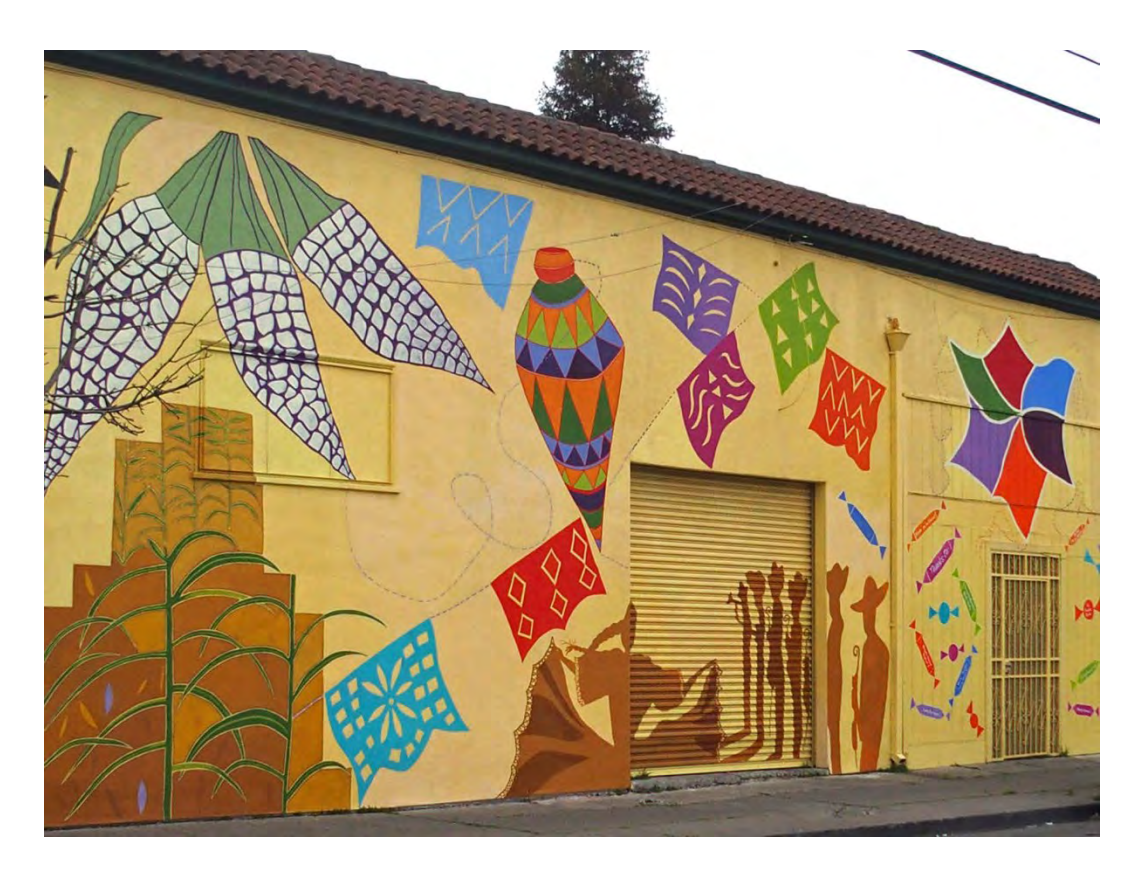
Fiesta at La Finca! 38th Street and Foothill Blvd