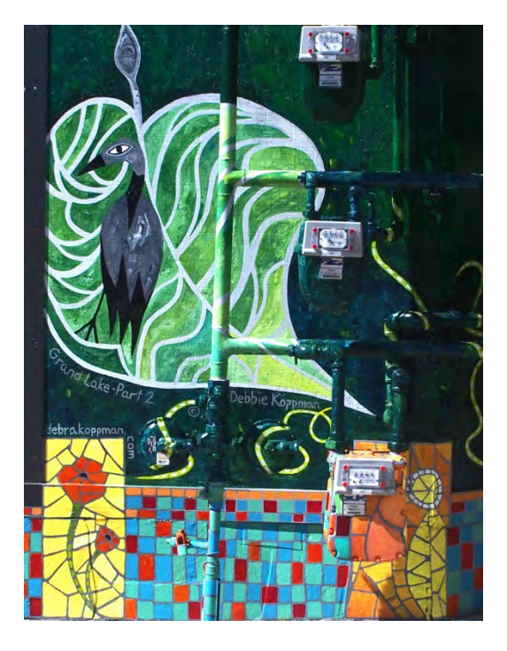
Grand Lake's Hidden Jewels, Grand Ave @ Embarcadero