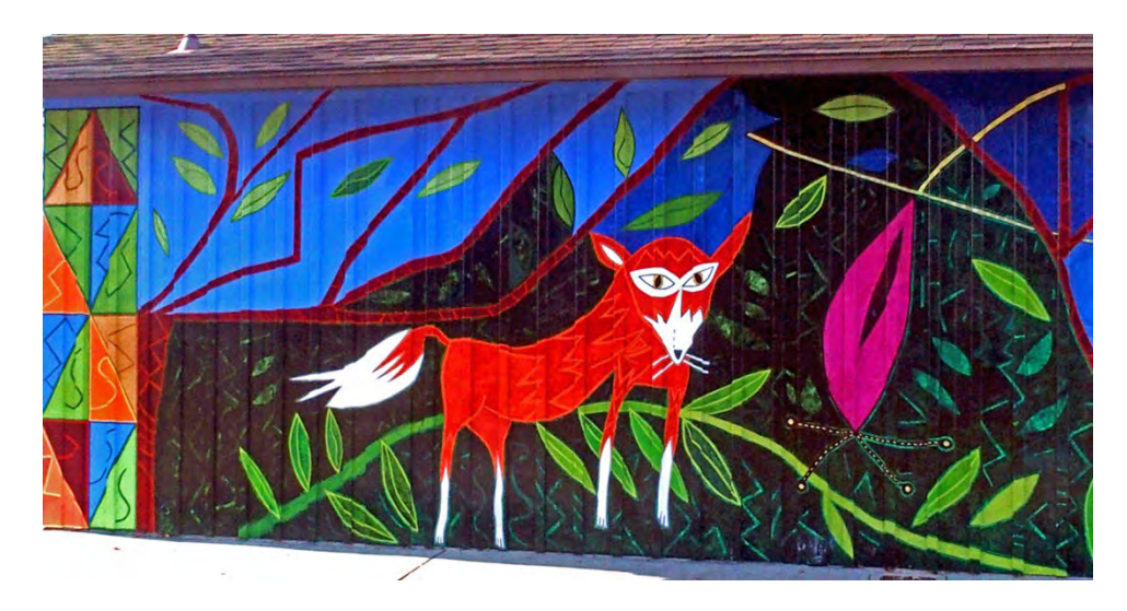
Palma Ceia's Magic Gardens, Palma Ceia Park, Hayward