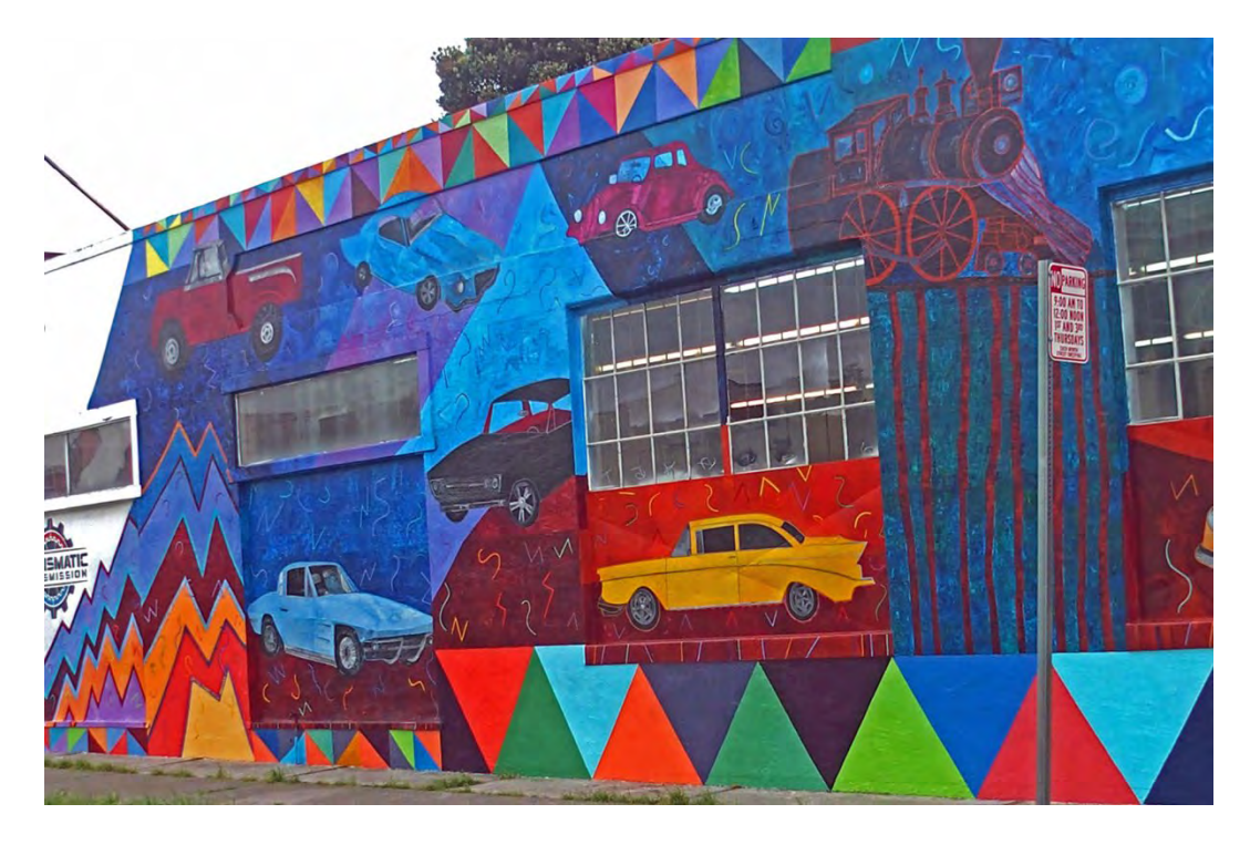
Traveling on International Boulevard, 39<sup>th</sup> St. and International Blvd.