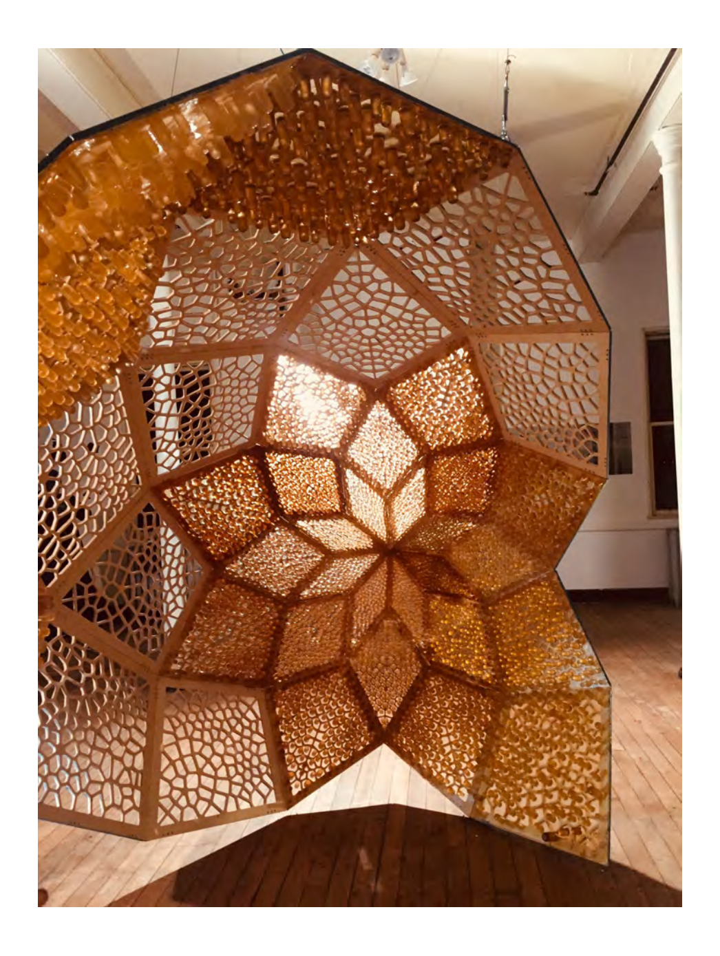
As Though it Rained from Stars 2018 8' x 16' Headlands Center for the Arts, Sausalito Wood, Rubber

As Though it Rained from Stars is a site-specific installation inspired by the starry dome of a 15th century Islamic bathhouse in the abandoned city of Mandu, India. Themed around questions on desire and longing, the work is both a tribute and a reckoning to the poetry, beauty, power and darkness of the stimulating and frenzied moment we live in.