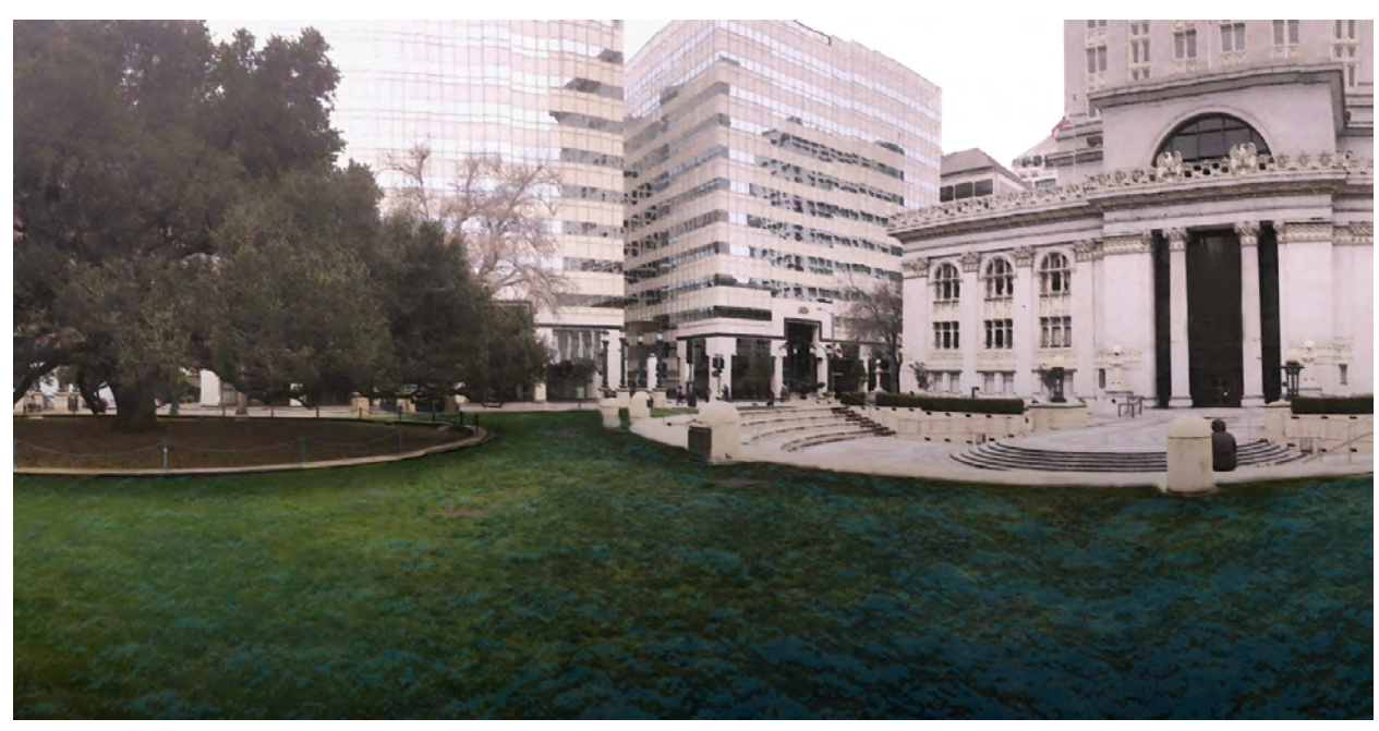
Row 2: Brooklyn Naval Cemetery "no-mow" wildflower meadow. Mowing a grass lawn only a few times a year allows plants, grasses, and wildflowers to re-inhabit the landscape. Below: Artist rendition of grass growth on the plaza.