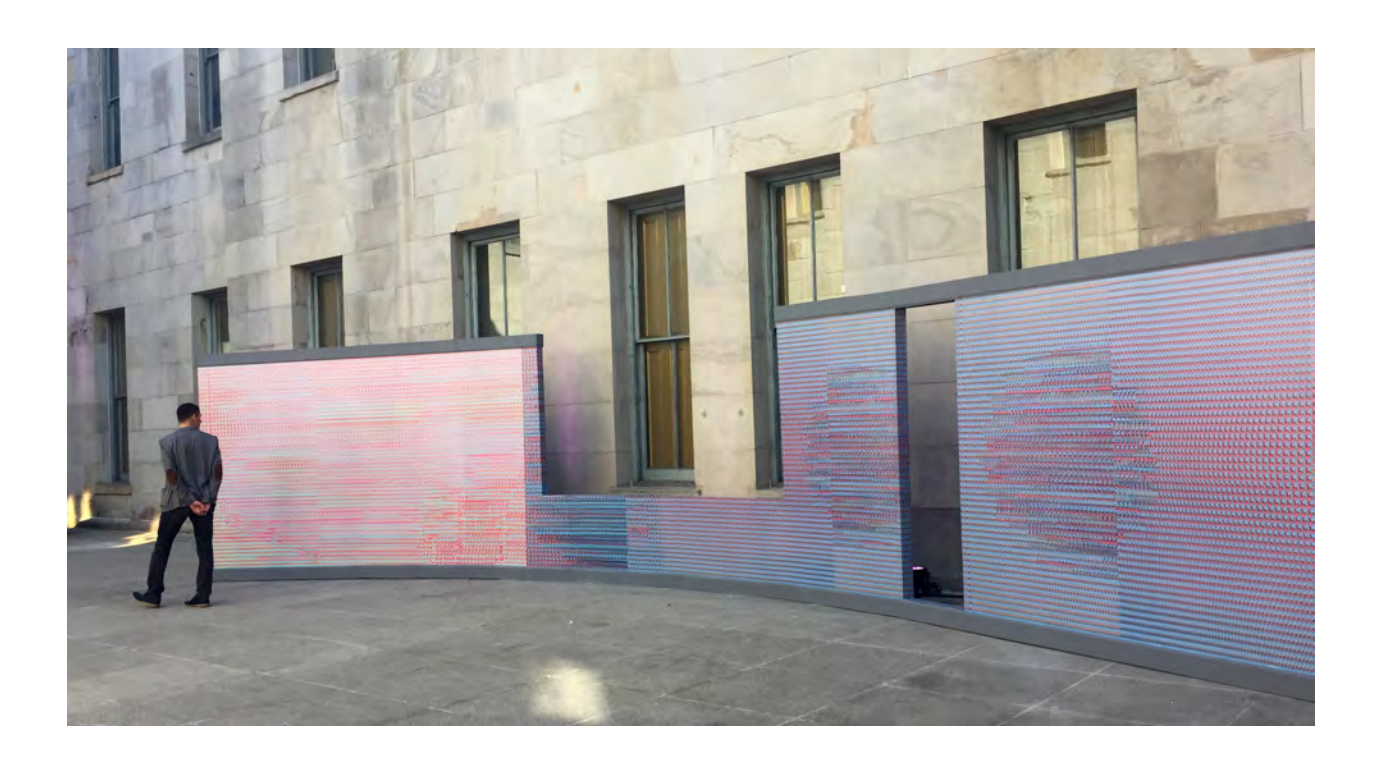
Distance 2017 50' x 8', wallpaper courtyard, San Francisco Mint Building

Distance is an installation that considers the relationships between interior and exterior spaces. Using autostereograms, a technology made famous in the 90s by the Magic Eye book series, the work examines how far apart things appear and how deeply entangled they can be.