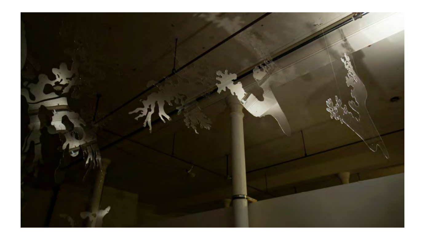
Willing 2017, 30' x 50', Acrylic, Thread Headlands Center for the Arts

Willing is an installation inspired by an essay in the Indian epic, the Mahabharata, a story about the evolution and destruction of human life over time.