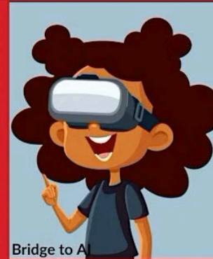
Bridge to A

FRIDAY, MARCH 21, 2025 • 8:30 AM-5:00 PM