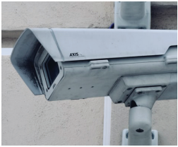
Install security cameras.