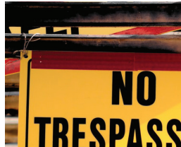
Post "No Dumping & "No Trespassing" signs.