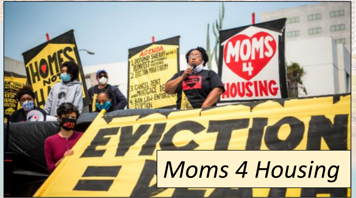
Moms 4 Housing