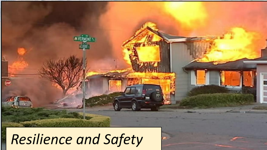
Resilience and Safety