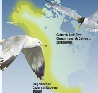
California Least Tern Charrán menor de California 加州姬燕鷗

Pacific Flyway Ruta del Pacífico norteamericana 太平洋候鳥航道