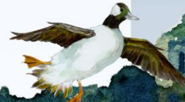
Bufflehead Porrón coronado 白枕鵝鴨