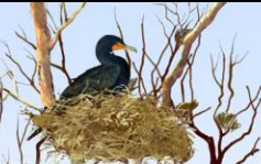
Double-crested Cormorant Cormorán de doble cresta 角鸛

How many birds shown on this sign can you see? How many different bird calls can you hear?