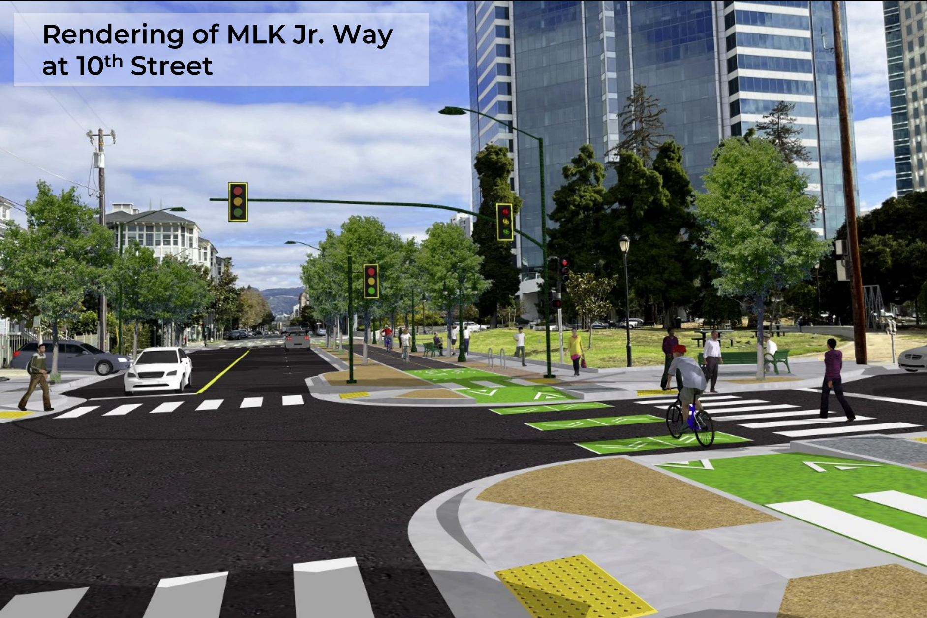
Rendering of MLK Jr. Way at 10 th Street