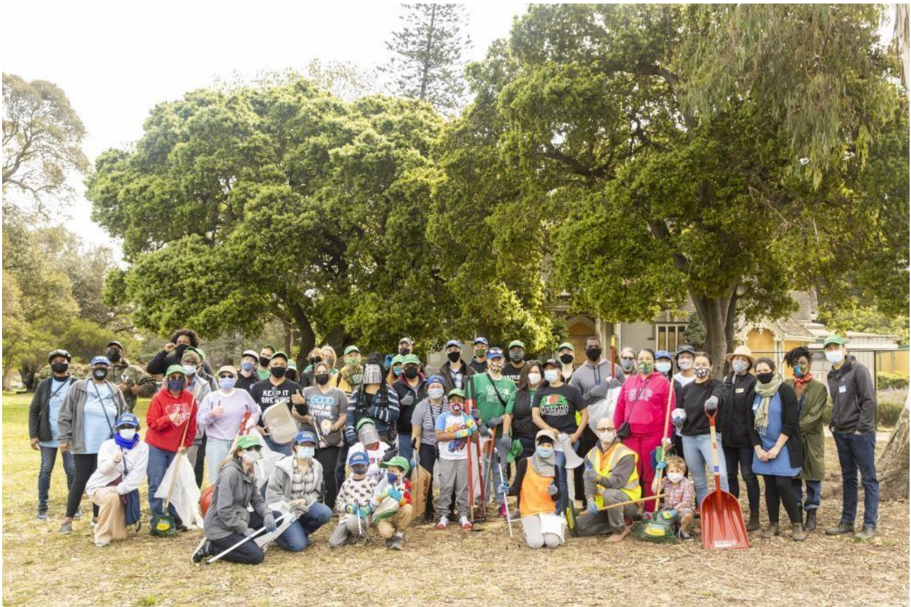
Earth Day volunteers in Mosswood Park on 4/24/2021

Thank you to the Oakland volunteers, elected officials, City staff and community partners who participated in Earth Day and Earth month activities! Throughout the month of April, Environmental Stewardship received reports of: