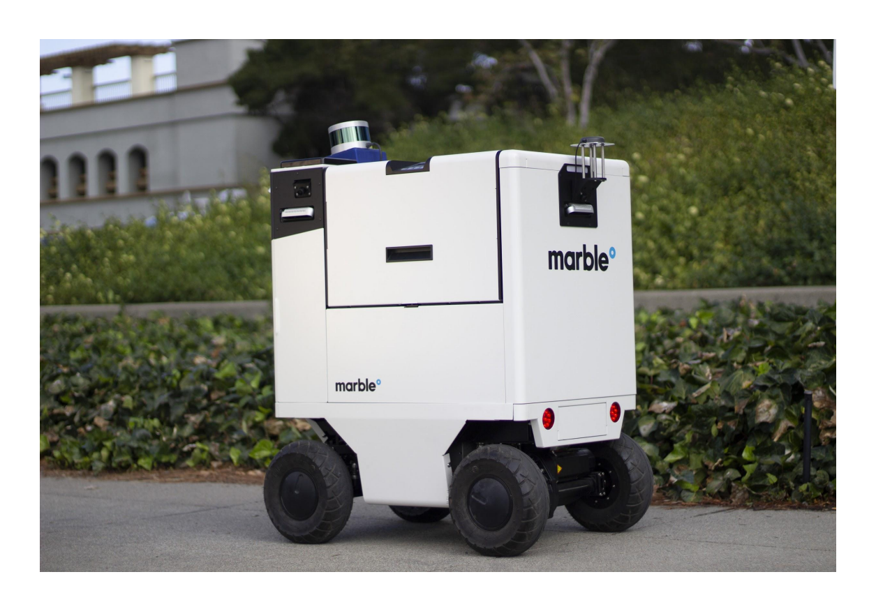
Page 10 of 12