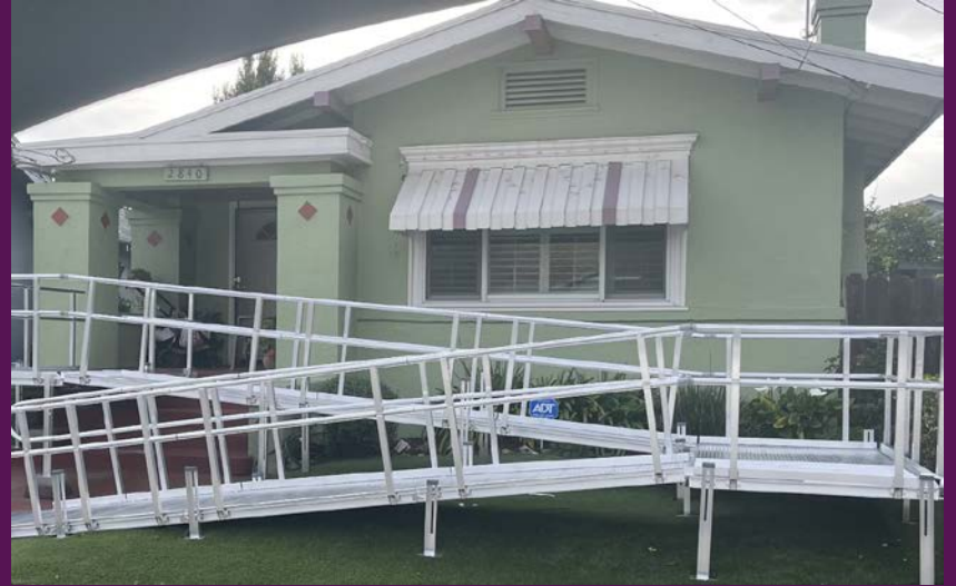
ID: "After" photo of consumer's house with newly installed aluminum ramp by RA Program