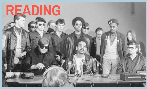
Fifty Years of Fred Hampton's Rainbow Coalition | Southside Weekly