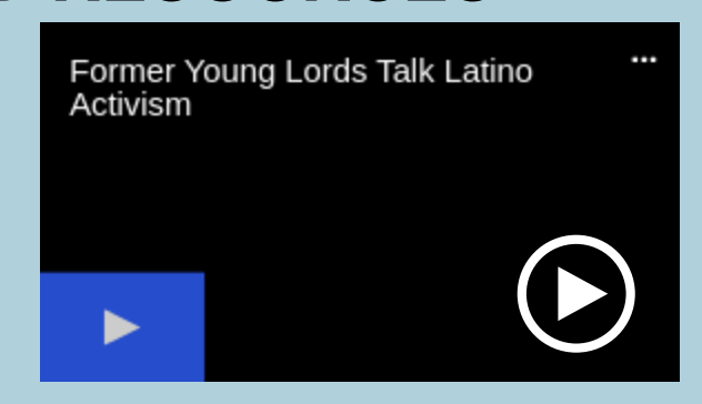
Young Lords Talk About Activism and Rainbow Coalition (4 min)