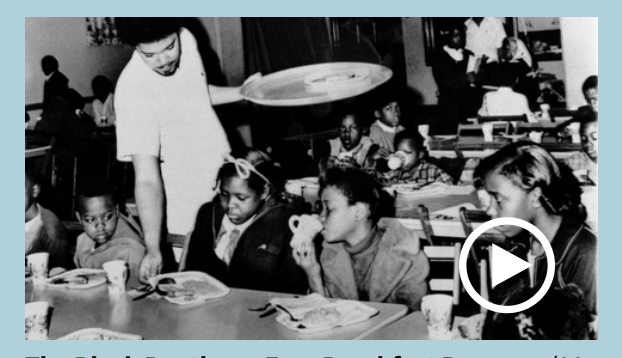
The Black Panthers: Free Breakfast Program (90 sec)