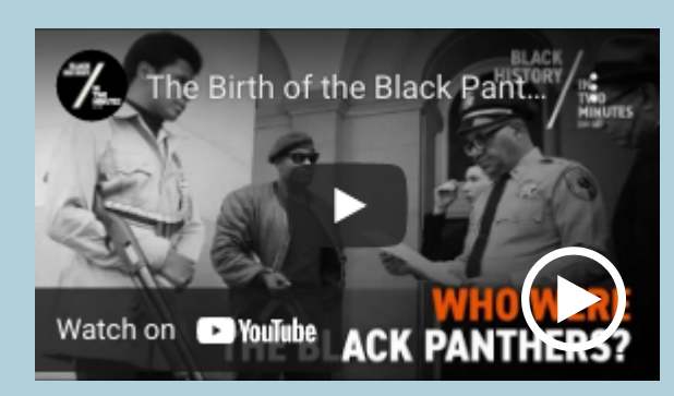
The Birth of the Black Panther Party (2 min)