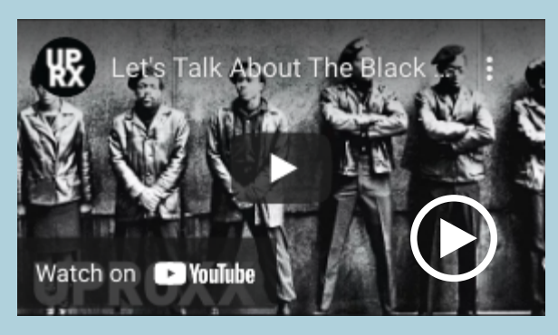
Let's Talk About the Black Panther Party (2 min)