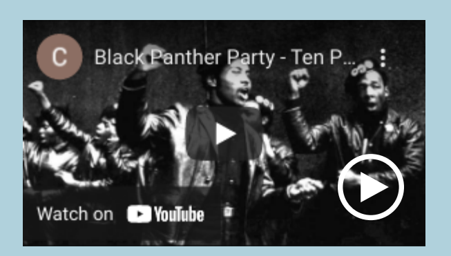
Ten Point Program (5 min)