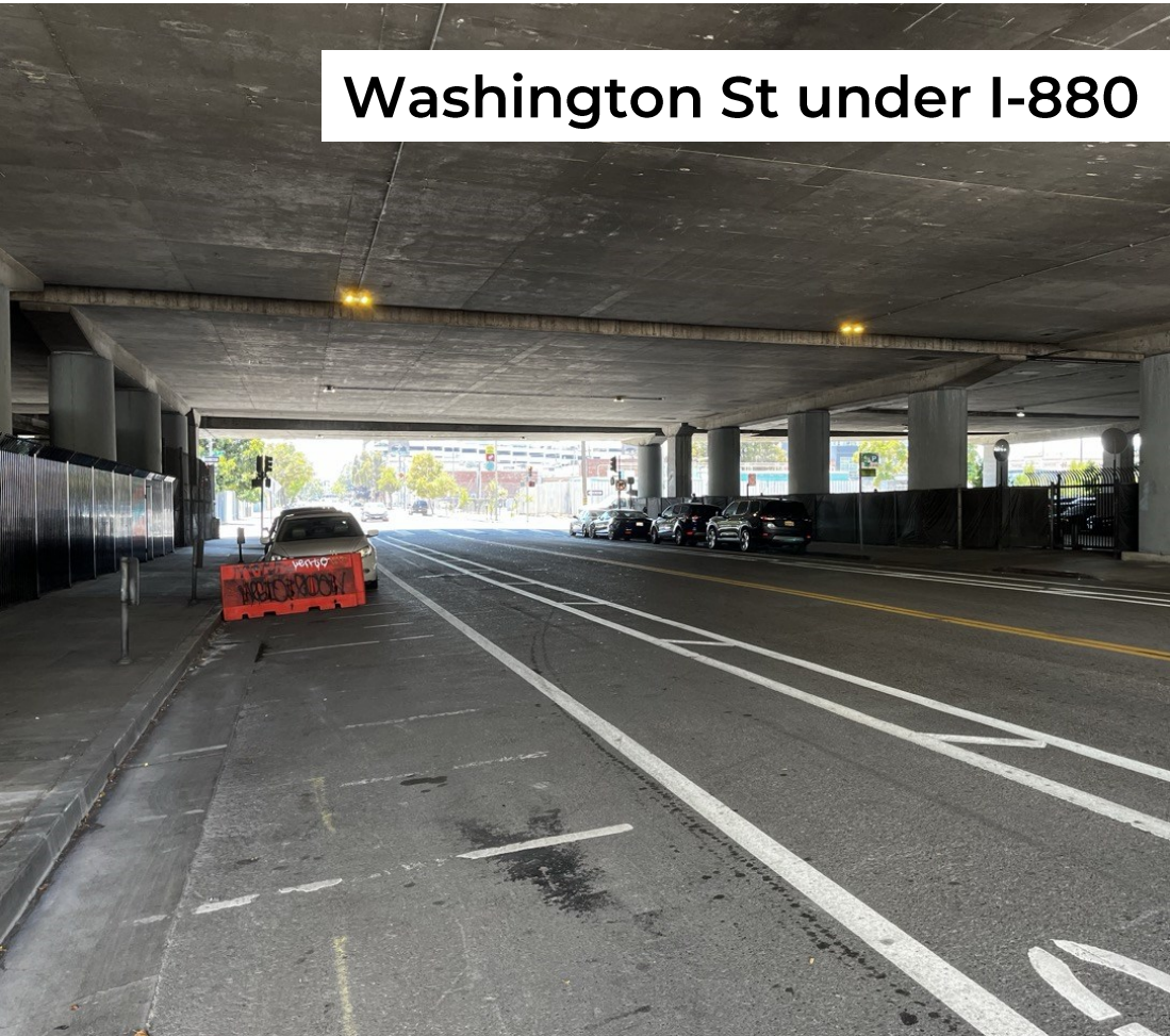
Washington St under I-880