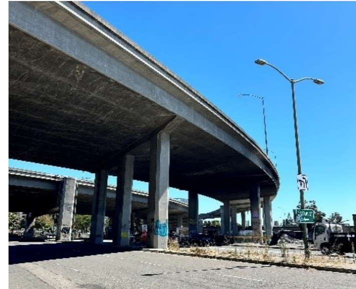
EXISTING clockwise from top left Broadway/I-880, MLK Jr Way/I-880, 7 th St/I-980, Washington St/I-880