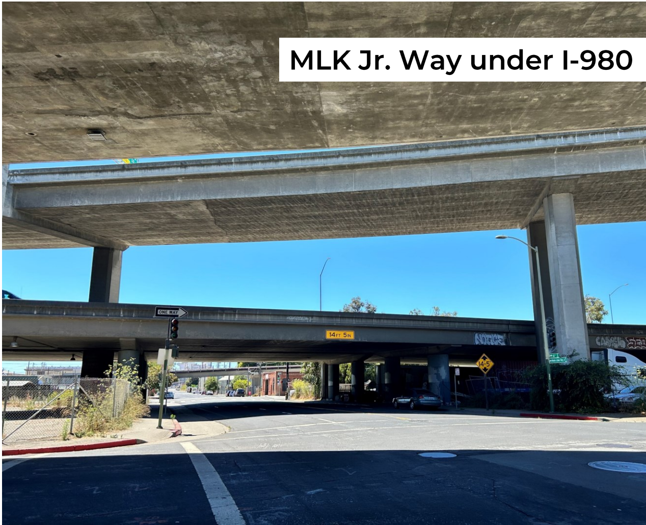
MLK Jr. Way under I-980