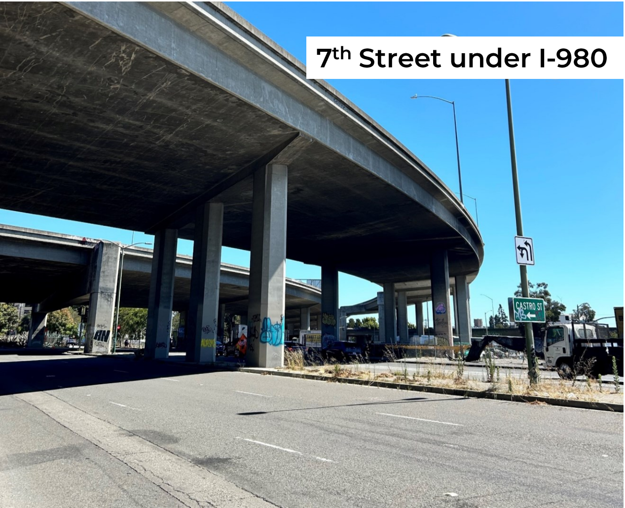
7 th Street under I-980

What would make these locations nicer to walk, bike, or roll through?