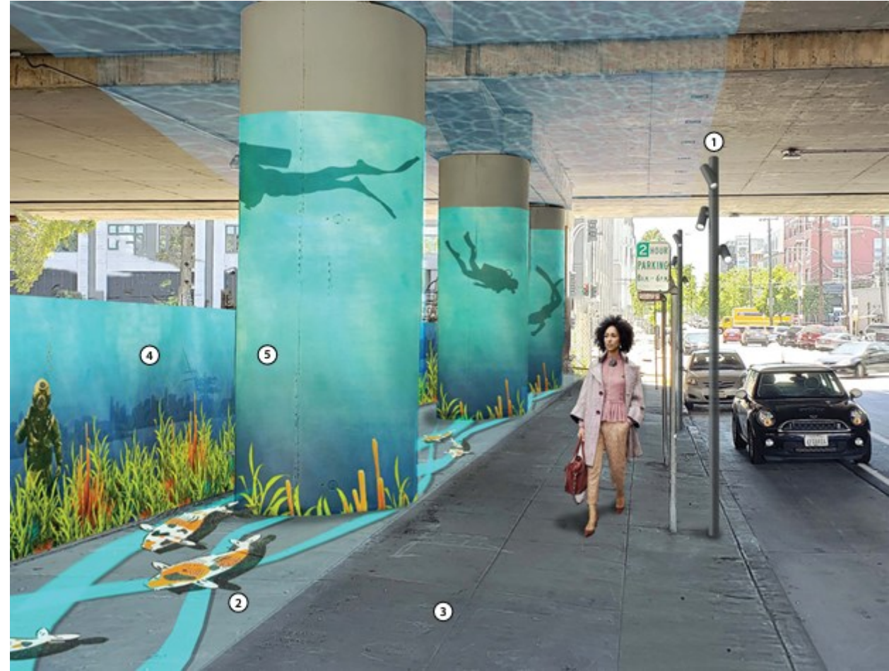
Walk This Way Concept rendering at Jackson St and I-880

www.oaklandca.gov/projects/walk-this-way