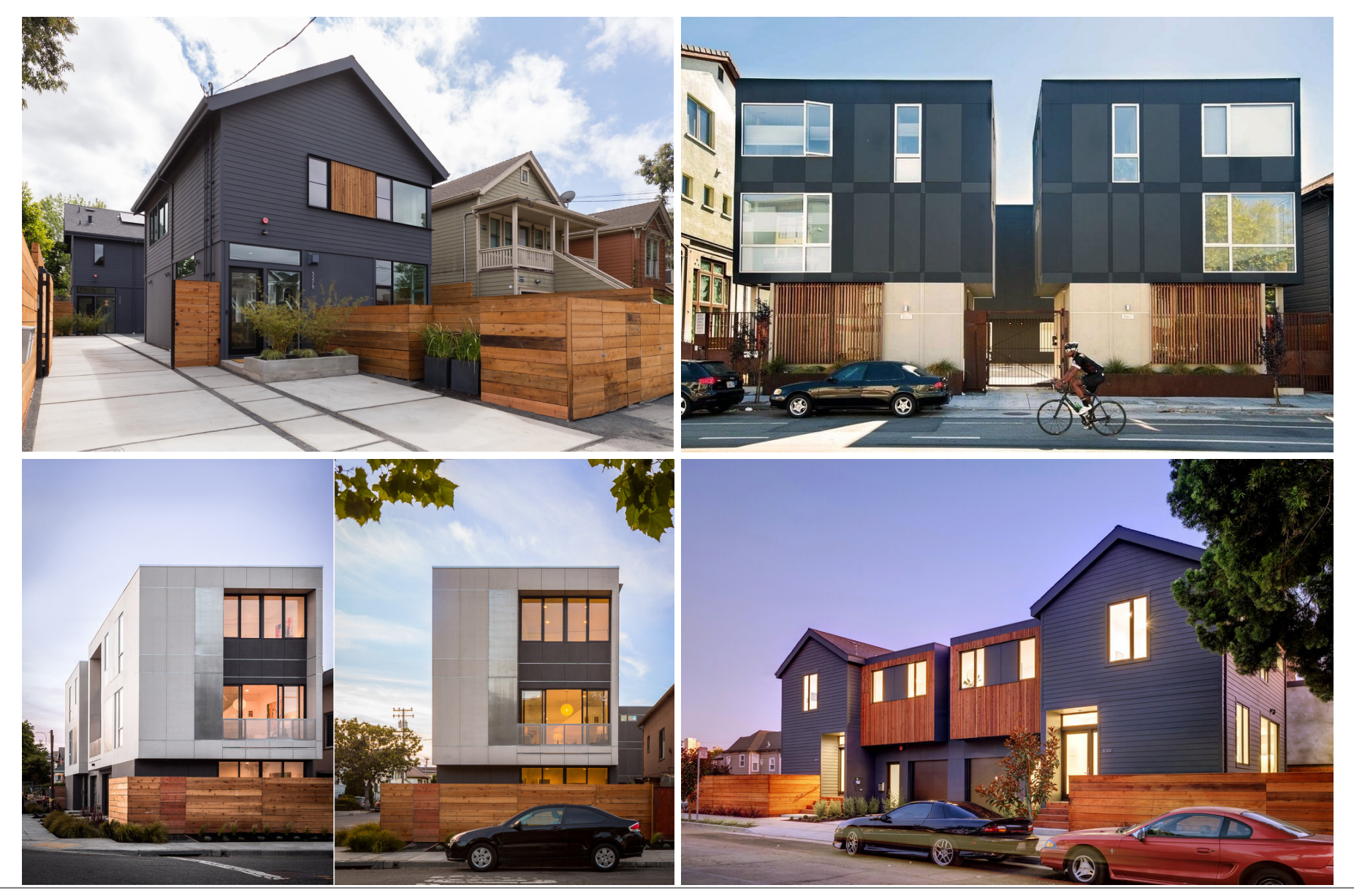
planning commission hearing - march 6, 2024