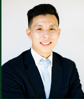
Jesse Hsieh (Commissioner) Selection Panel, Oct 2025