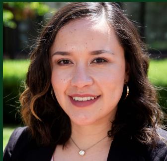
Karely Ordaz (Alternate Commissioner) Mayoral, Oct 2023