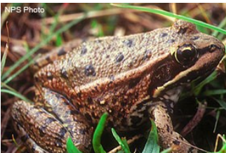
California red-legged frog

FEMA Biological Opinion https://fema.gov/disaster/4683/news-media