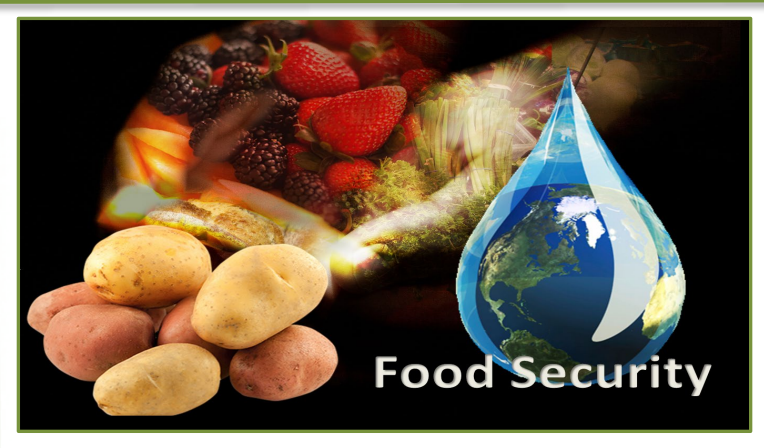
Health & Wellness