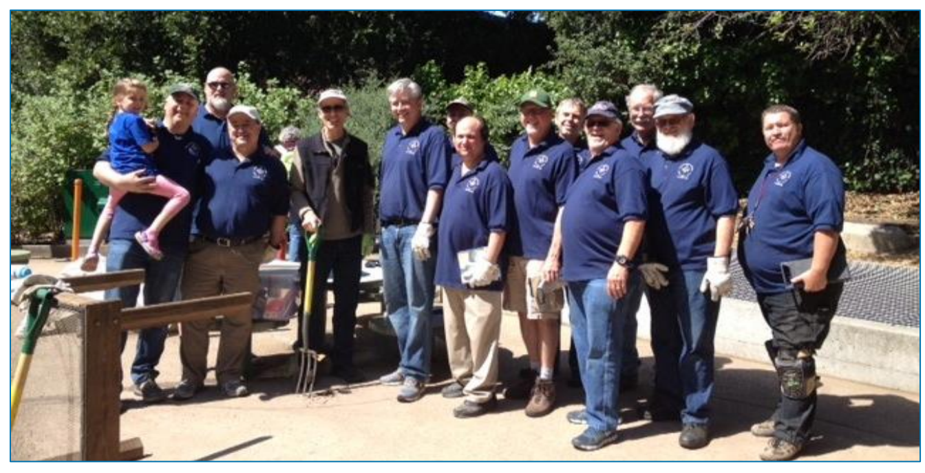
With volunteers during Earth Day