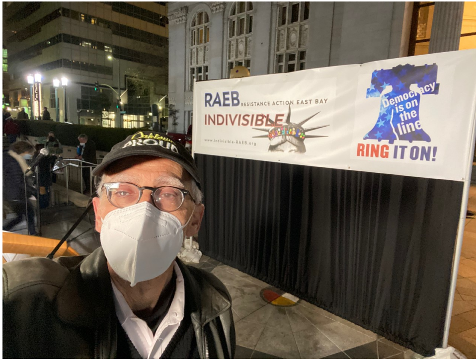
Dan at the January 6th Resistance Action East Bay & Indivisible Rally/Vigil in support of respecting Democracy and protecting voting rights in our country.