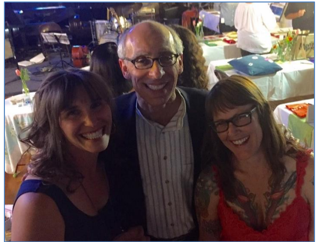
At the Emerson Elementary School parent-teacher auction fundraiser

In addition to receiving my periodic e-newsletter, I invite you to follow me on Facebook and/or Twitter . And to read past newsletters, click here .