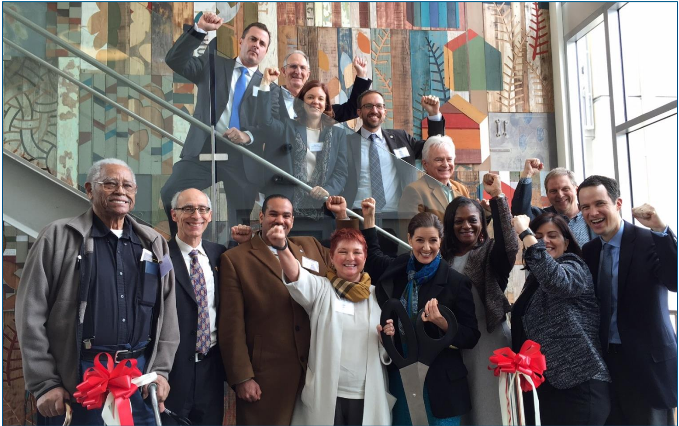
Ribbon-cutting at Mural affordable housing at the MacArthur BART Transit Village.