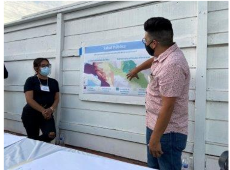
City of Oakland staff and Spanish Speaking Citizen's Foundation presents at a workshop in Fruitvale