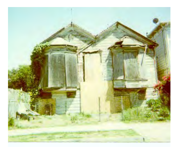
Example of Residential Rehab-before

This program helps implement the City of Oakland's affordable housing development programs. City staff works with for-profit and non-profit developers to revitalize neighborhoods and increase housing opportunities through new construction, substantial rehabilitation and preservation of rental and ownership housing for very low-, low- and moderate income households.