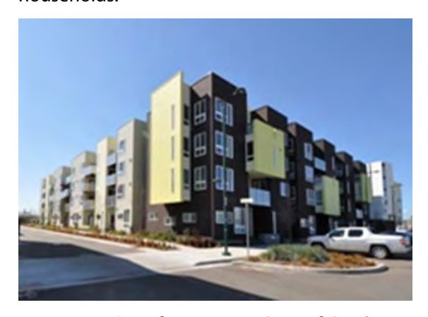
Iron Horse Development at Central Station

In 2011, there were a total of 10,444 units in the Plan Area. As the above analysis illustrates, there were 3,217 long term affordable housing units — 3,100 with affordable rental restrictions (including 786 units owned and operated by the Oakland Housing Authority) and 117 affordable ownership housing units. In addition, the 1,189 Tenant Based Affordable vouchers provided additional affordability to households, although some of those voucher holders live in the 2500 or so non-OHA affordable units, and use the vouchers for deeper levels of affordability for their households.