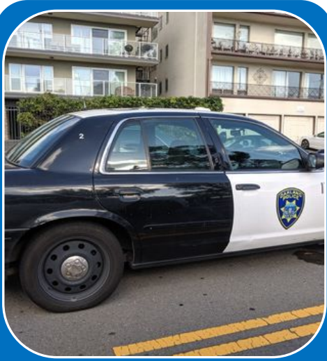
[Goal Area 1] Policing and Safety