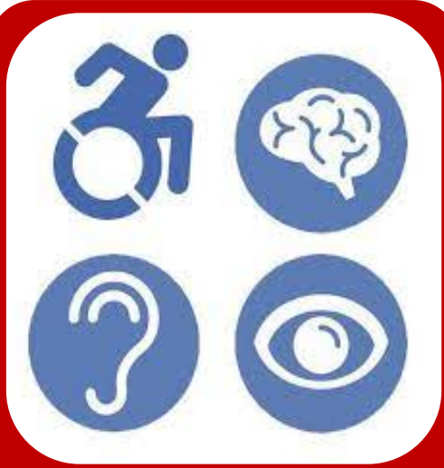
[Goal Area 3] Accessibility of City Programs