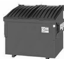
Bins (cubic yards)

TRASH (Number of Carts or Bins): ___ 20 gal ___ 32 gal ___ 64 gal ___ 96 gal ___ (___) Cubic Yards