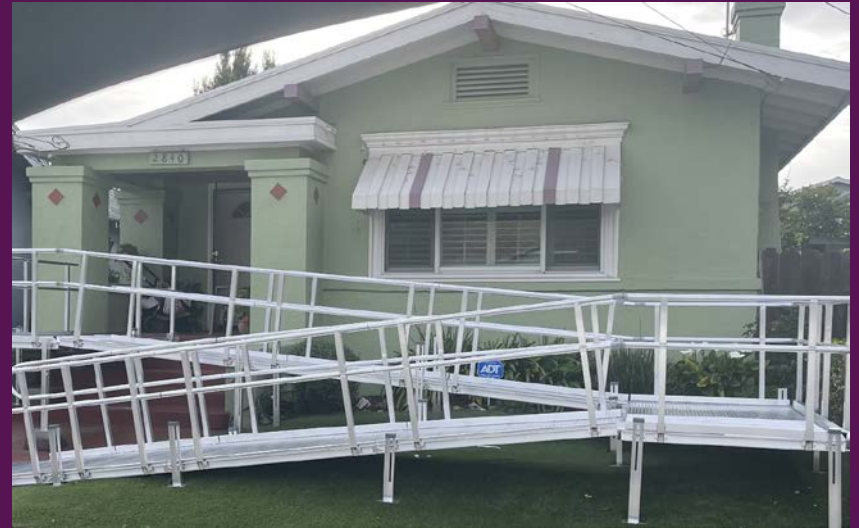
ID: "After" photo of consumer's house with newly installed aluminum ramp by RA Program