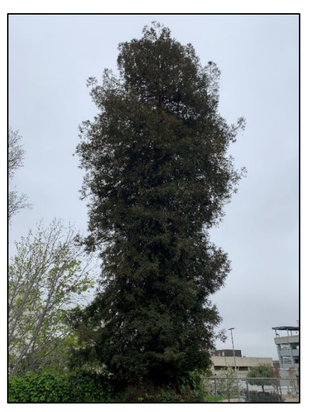
Photo 3: Coast redwood #86 had a narrow crown and had been previously topped. Ivy engulfed the base of the tree.