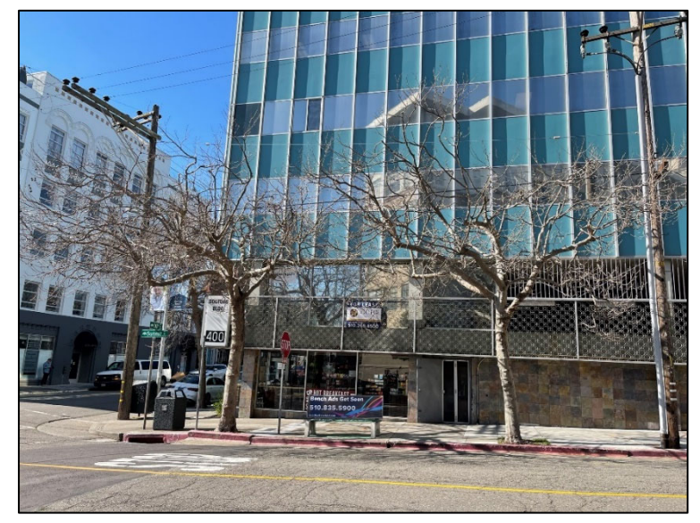
Photo 2: London planes #179 and 180 (left – right) were in fair condition. Multiple branches arose from between 9 – 10 feet, creating a low crown beneath overhead electrical utilities.

Four London planes (Platanus x hispanica) were in tree wells along Summit Street. Trunk diameters measured either 13 inches (tree #180) or 14 inches (#179, 181, 182), indicating semi-mature development (Photo 2). Trees #179, 180, and 182 were in fair condition with multiple branches arising between 9 - 10 feet above grade. Overhead high-voltage electrical distribution lineclearance pruning resulted in low, densely budding crown profiles. Tree #181 was in poor condition. A previous branch failure left an approximately 5-footlong tear-out wound on the south side.