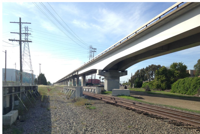
Project corridor in San Leandro south shared by UPRR – an active freight rail line.