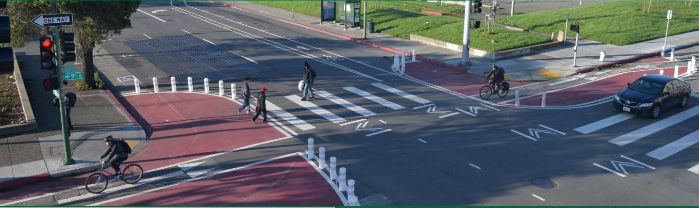
Image of 8 th Street at Madison Street