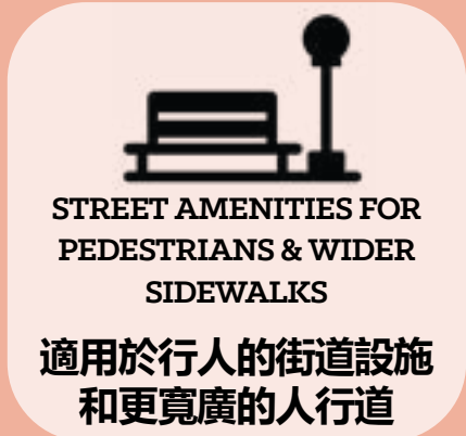
STREET AMENITIES FOR PEDESTRIANS & WIDER SIDEWALKS 適用於行人的街道設施 和更寬廣的人行道

社區成員討論到為行人提供的街道改善，要求無障礙、暢通無阻的人行道。有些居民覺得廠商或企業佔用了太多的人行道。有些社區成員認為人行道不乾淨。其他建議的改善事項包括：座椅、照明、垃圾桶、遮陰、公車站、盆栽和防撞分隔桿。