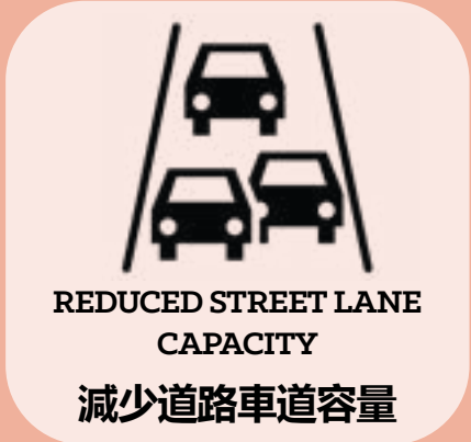
REDUCED STREET LANE CAPACITY 減少道路車道容量

社區成員討論到減少道路車道容量，這是過去的社區參與中的主題之一。建議的改善包括道路瘦身、路緣向外延展，或是降低車速。有些社區成員建議為企業設置卸貨區，以減少並排停車的交通流量。