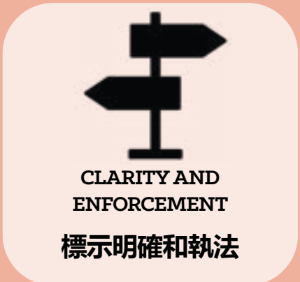
CLARITY AND ENFORCEMENT 標示明確和執法

社區成員要求學校前要有用於接送的淨空地帶、廠商的裝貨區，和人行道上的販賣區。社區成員也建議設置更多有關規定的標誌。為了減少壅塞，社區成員建議增加符合語言的標誌以供尋找方向，引導前往平價的區域停車場，並為單行道提供指引。