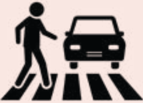
PEDESTRIAN FRIENDLY INTERSECTIONS 行人友善十字路口

Community members spoke positively of scramble crosswalks, and many people suggested that they be added to additional intersections. Community members also requested increased crossing time on crossing lights and more bulb-outs to decrease crossing distance.