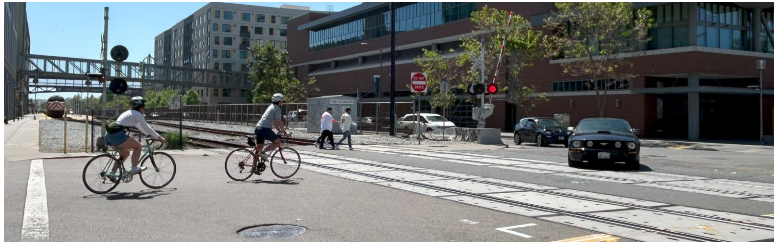
EXISTING clockwise from top left Embarcadero West at Washington St, Clay St, and Webster St