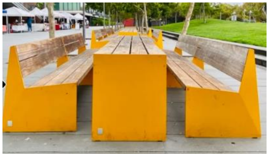
“Jack London Square style”