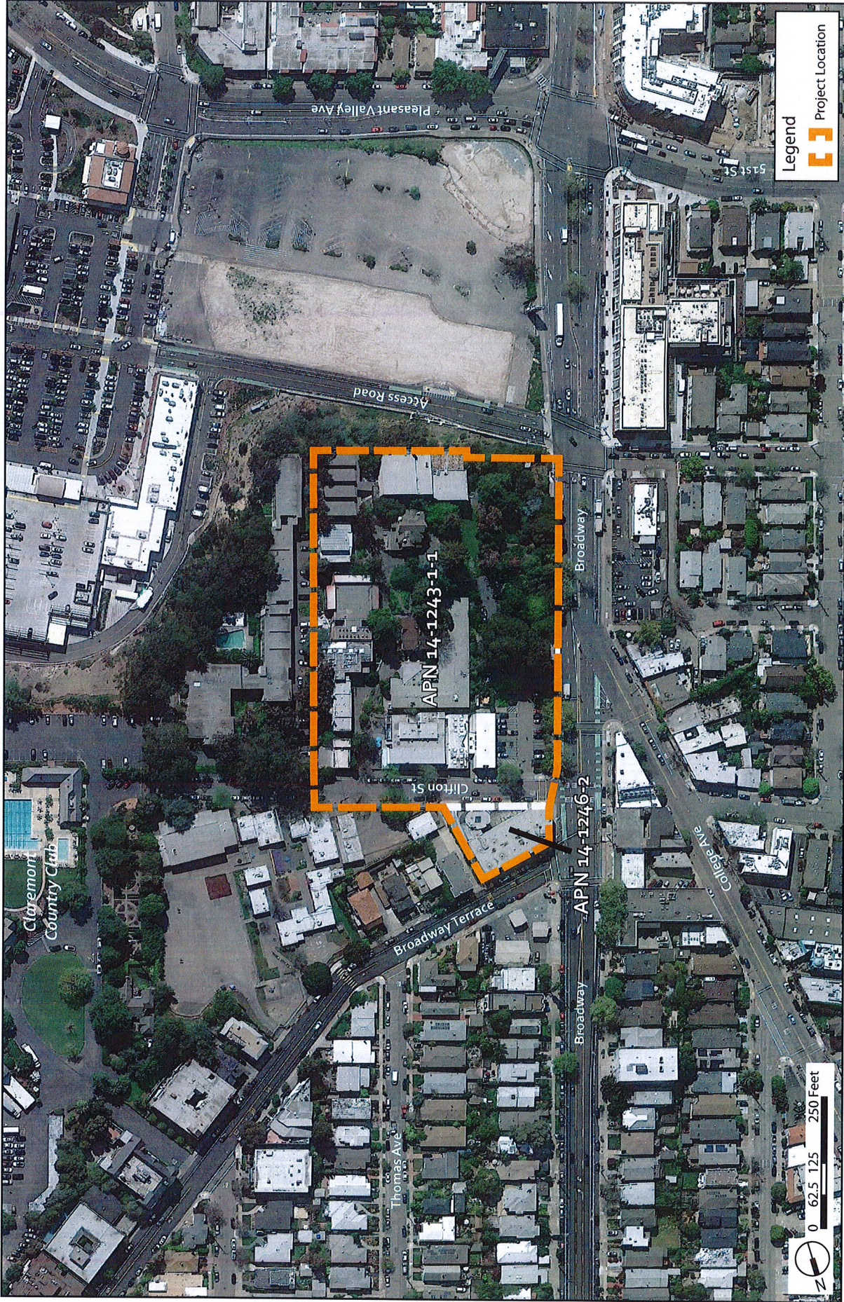
California College of the Arts and Clifton Hall Redevelopment Project Notice of Preparation